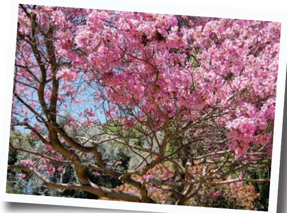
Beautiful blooms at Pasadena's Huntington Botanical Gardens

Back in Pasadena proper, Ten Thousand Villages , a non-profit retail shop, sells fair-trade, sweatshop-free goods that make great gifts. Browse their fun selection of home décor items, jewelry, and handmade hammocks. If