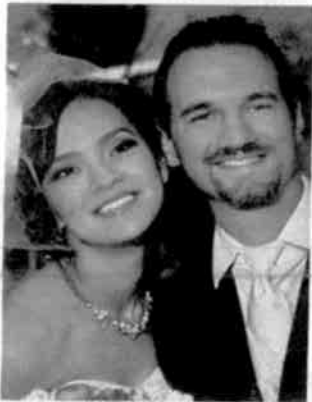
WEDDING BELLS Kanae, Nick tie the knot on Feb. 12, 2012.

Vujicic's company became overextended, and he wound up