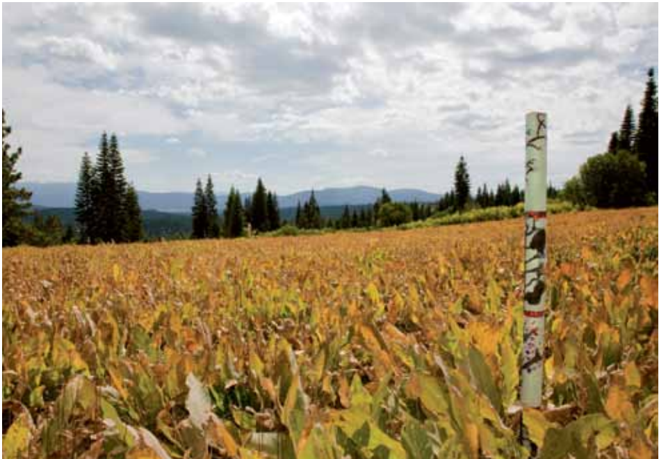
InnerRhythms’ dancers and Chief RedHawk perform during “Terra-Caeli” at the Tahoe Donner Equestrian Center in 2009 (inset) Original art rises from the ground in “Terra-Caeli,” 2009