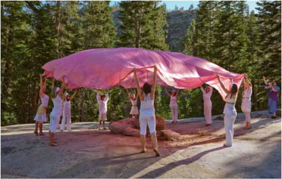
Dancers float a pink canopy above their heads during “If Dreams were Clouds,” 2010