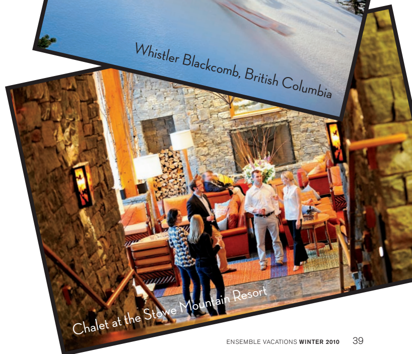
Chalet at the Stowe Mountain Resort

The largest ski resort town in the northeastern U.S. leads the field in winter village mystique. The excitement of tree skiing and the sheer physicality of the steeps, plus the heavy winter backcountry snowfall in excess of 300 inches, were the original draw in the '60s. Today, the blueblood crowd still packs both mountains each year for the combination of idyllic terrain and the romance of New England . More than 116 trails and 13 lifts cover 39 ski miles, encompassing Mount Mansfield for experts, Spruce Peak for beginners and intermediates, plus countless wild miles for cross-country skiers. The challenges of the Front Four extreme downhill runs – Goat , Lifeline , National and Starr – continue to create storytelling sessions par excellence for skiers and audiences alike during après-ski unwinding.