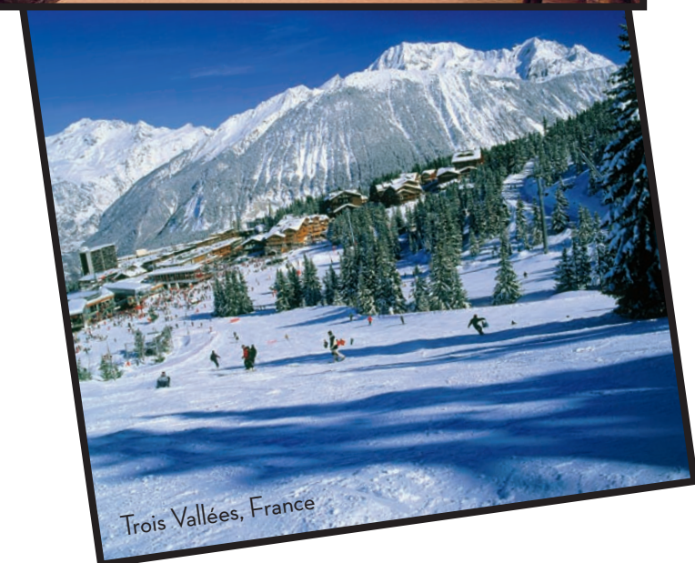
Trois Vallées, France