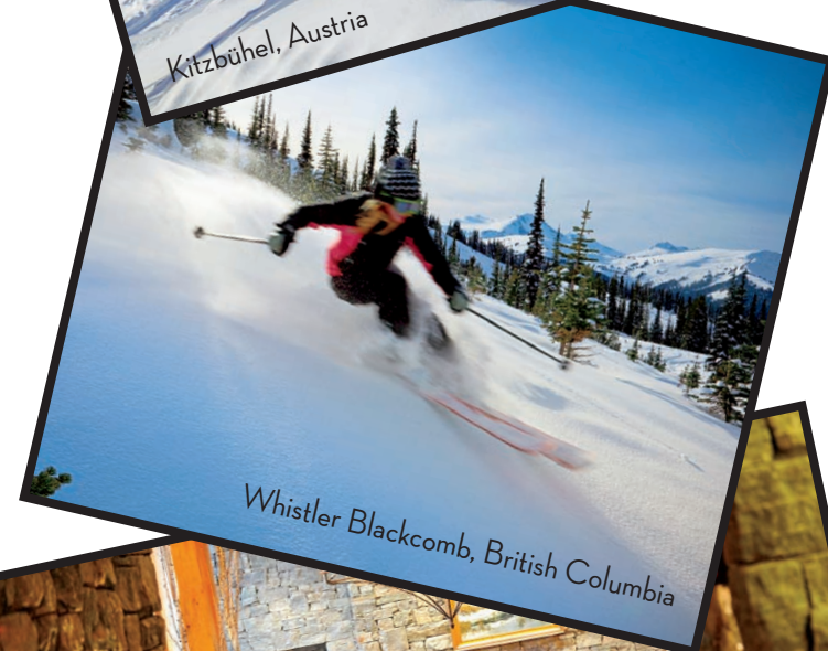
Whistler Blackcomb, British Columbia

The Olympic Selection Committee got it right when they selected Vancouver for the 2010 Winter Olympics, in large part because of the twin peaks at Whistler Blackcomb . Reliable snowfall, along with the two highest vertical rises in North America spreads over 7,000 acres of chutes, bowls, steeps and the signature Couloir Extreme double black diamond run. Whistler Blackcomb is served by the dreamy new Peak 2 Peak Gondola , a high-speed system that connects skiers to more than 200 trails and additional acreage in Garibaldi Provincial Park . Luxurious off-hill attractions mix with sensational skiing to create a winning ambiance felt throughout the bustling village. The season runs from late November until early June, and those in the know travel from Vancouver aboard the Rocky Mountaineer train via the breathtaking three-hour Whistler Sea to Sky Climb .