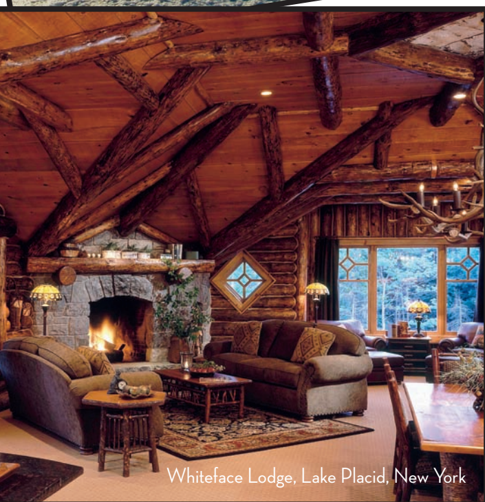
Whiteface Lodge, Lake Placid, New York