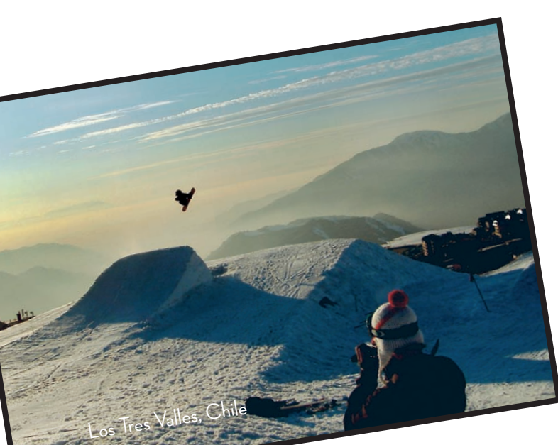
Los Tres Valles, Chile