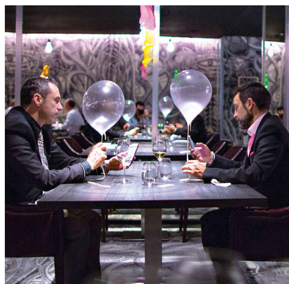
JUST DESSERTS From top: Alinea Madrid's dessert course is created on top of the table; diners contemplating the edible green-apple helium balloons; artist Joan Miró served as plating inspiration for the rouget course.

which—no ketchup, of course—were captured perfectly in a small gel-like treat. That whimsical and delicious bite set the tone for the rest of the meal.