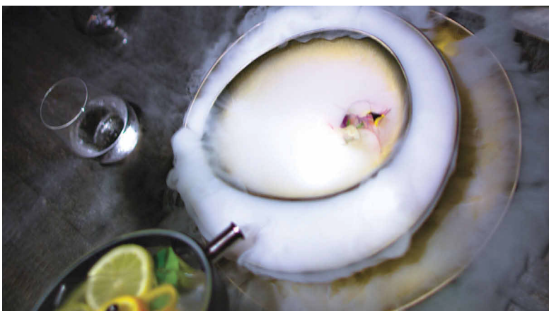
WHERE THERE'S SMOKE Clockwise from top: Grant Achatz (front) and his Chicago team in Madrid; moqueca with sea bass, lobster, tiger's milk, coconut and citrus vapor; a server spray-paints a green parsley sauce onto the plate for the Graffiti wild-mushroom course.

« “I was worried that when an American restaurant that did progressive cuisine came onto their turf, they might resist and rebel against it. But everyone was very receptive, and the reviews were really great.” —GRANT ACHATZ, CHEF-PARTNER, ALINEA »