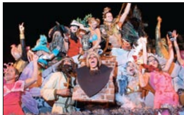
Revelers at last year's Village Halloween Parade.

October 31. American Museum of Natural History, 4pm-7pm, $9, members $8. Curious George, Clifford the Big Red Dog, and Bunnica are among some of the kid-friendly characters greeting kids at the museum doors. Halls will be open after hours for trick-or-treating, arts and crafts and performances