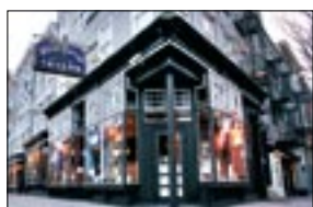
The famously haunted White Horse Tavern