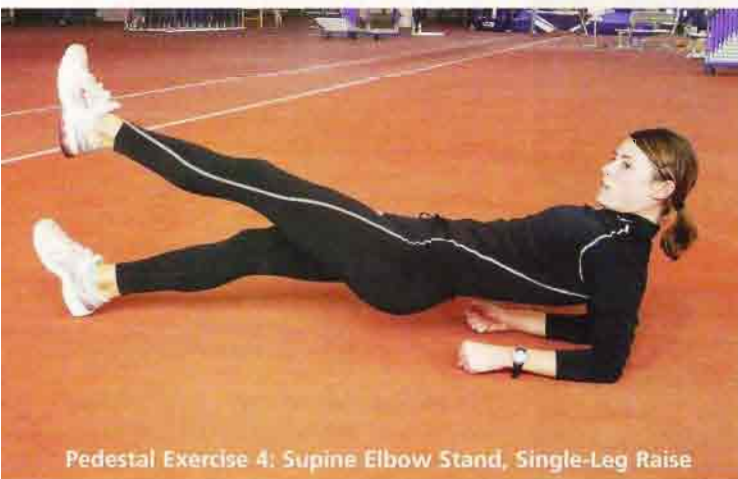
Pedestal Exercise 4: Supine Elbow Stand, Single-Leg Raise