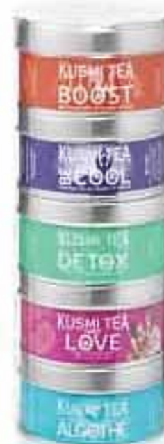
The five wellness blends from Kusmi Tea (Boost, Be Cool, Detox, Sweet Love and Algotea) are available in a gift stack.

While many of us wait until January to restore, we're keeping some on hand for the holiday season. We hear that Detox (Orebi's personal favorite of the wellness blends) is just the remedy for an upset stomach after a night of overindulging.