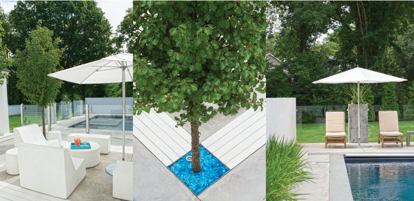
Glass, concrete, and stainless steel are used in the outdoor design as well. A few years in, the grass in the planters was replaced with blue glass. opposite: The seating and dining areas on the "summer patio" are surrounded by white Trex slats that break up the concrete of the deck.

and for two weeks every April, the family enjoys the trees' gorgeous white blooms.