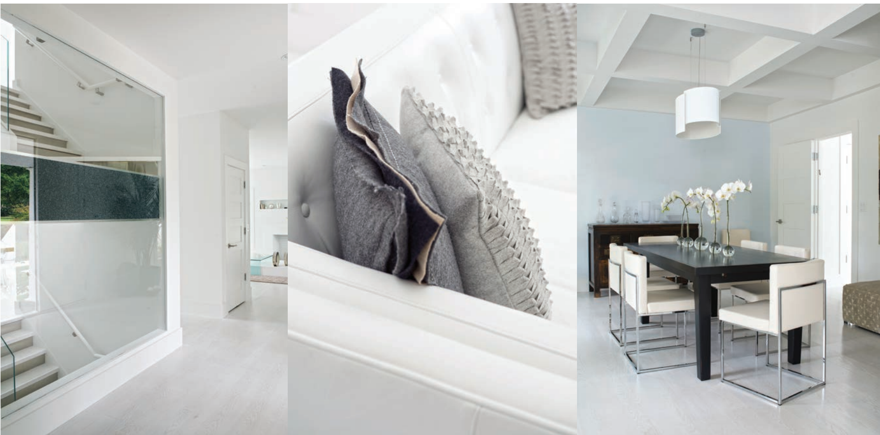
The glass staircase allows for views from the front door all the way through the home to the backyard. In the dining room, Phillip Jeffries's "Lacquered Walls" covers one wall. "The color that I picked was actually a bright white, but it casts a very pale blue—my intention was for it to be white!" laughs Terri. The buffet is an antique.

Together, they settled on a shingled New England Colonial style for the home's exterior, and a more modern interior with an open layout and a palette of stainless steel, concrete, and glass. From there, "it really evolved" says Greenberg. "We started with a basic set of plans, and then all the details—the glass railings, the windows, all the things that make it a special house—kind of came out along the way."