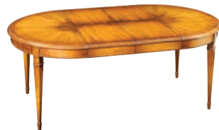
NEW DIRECTOIRE TABLE