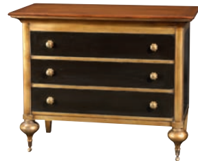
NEW INDOCHINE DRESSER