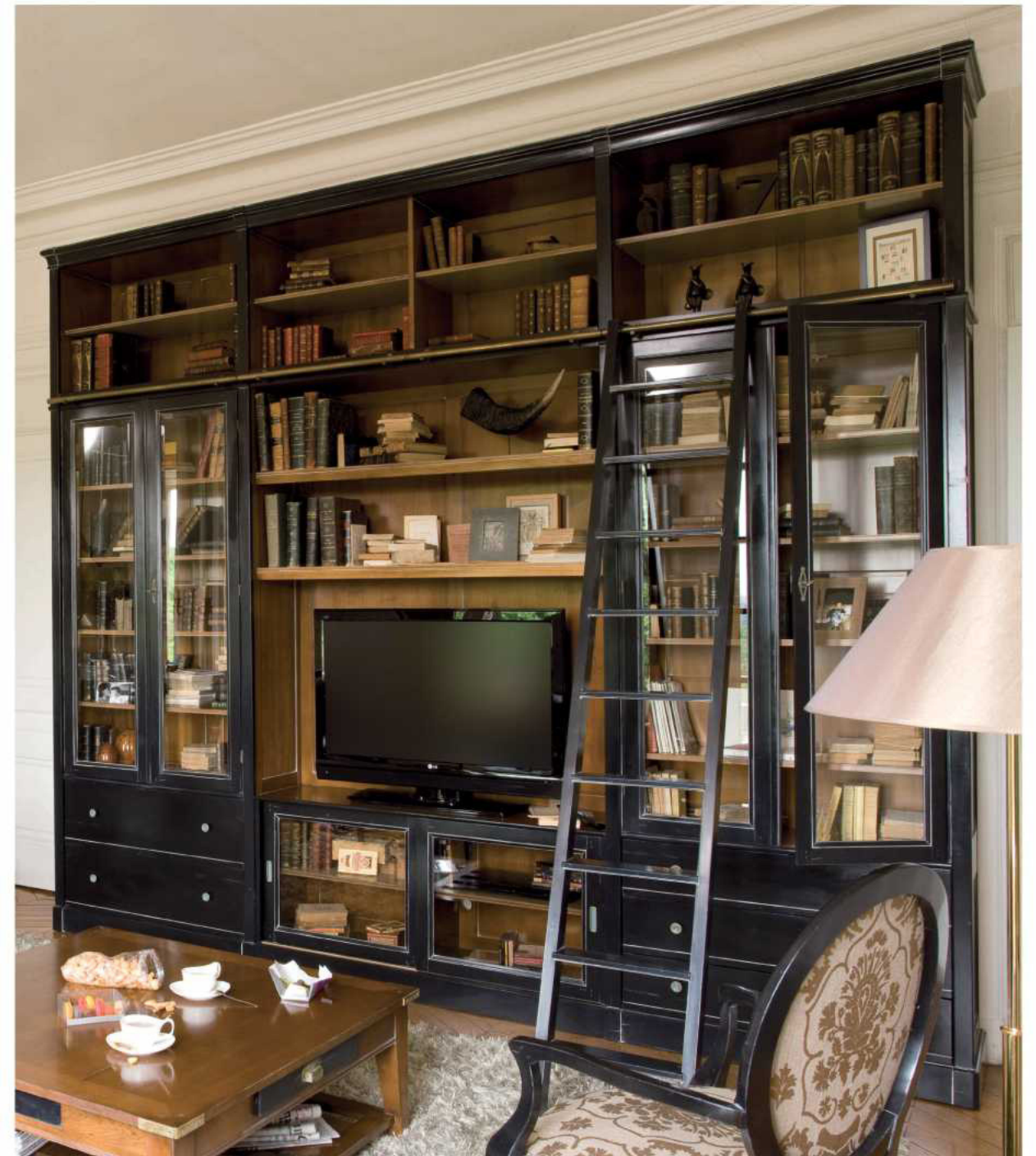
Featured: European Bench-Made custom Modular Units. Available in Multi Heights, Depths, Functions and Finishes.