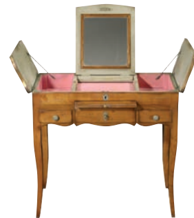
MARIE ANTOINETTE VANITY