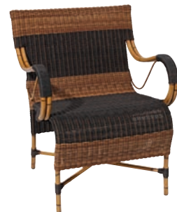
OUTDOOR VELUM CLUB CHAIR