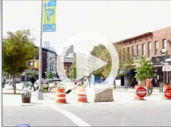
Putnam Ave. construction wrapping up in Clinton Hill

A block party to celebrate the plaza will be held this Sunday with live performances, food tastings and other activities.