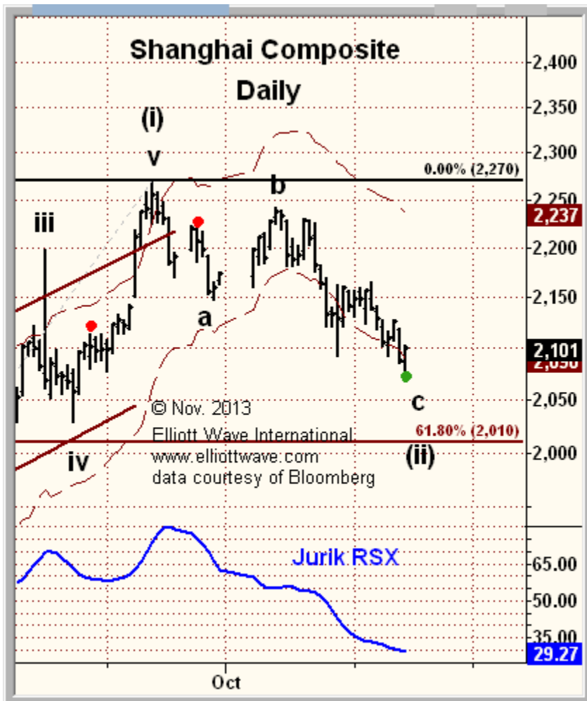
Created with TradeStation. ©TradeStation Technologies, Inc. All rights reserved.

We have been looking higher in Chinese stocks. In fact, this chart we published in the November 14 issue of The Asian-Pacific Short Term Update (APSTU) predicted the rally before the conclusion of the Third Plenum, where the one-child policy changes and other economically significant reforms were announced: