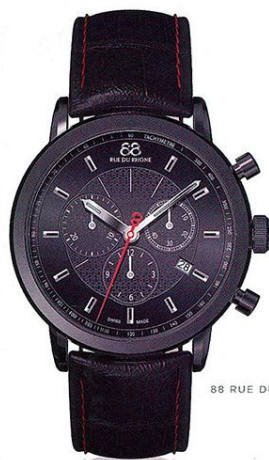
88 RUE DU RHONE