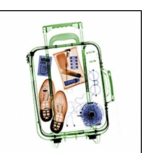
Store Your Carry-On Correctly