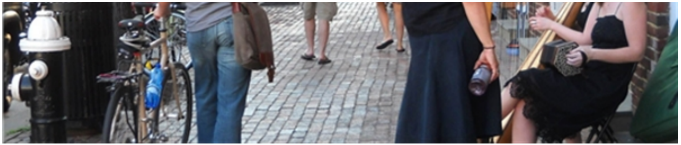
22 Things You Need To Know About Washington, D.C. Before You Move There