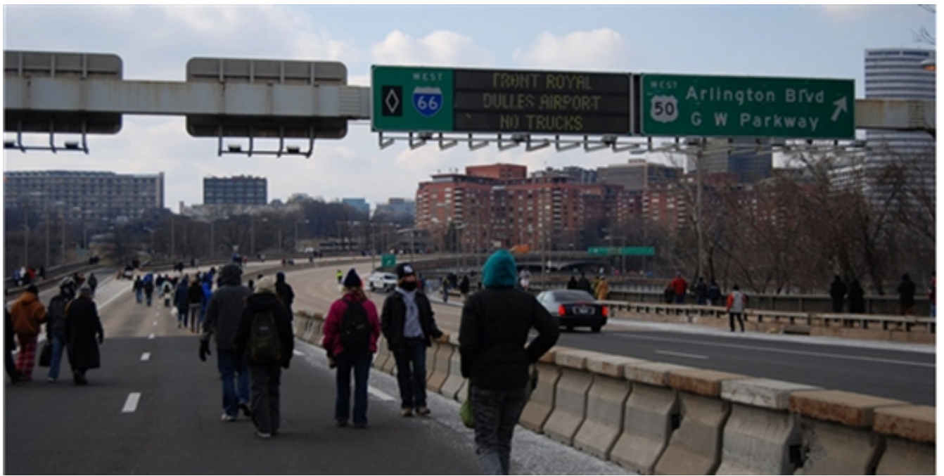
20 Things You Learn During Your First Year Of Living In Washington, D.C.