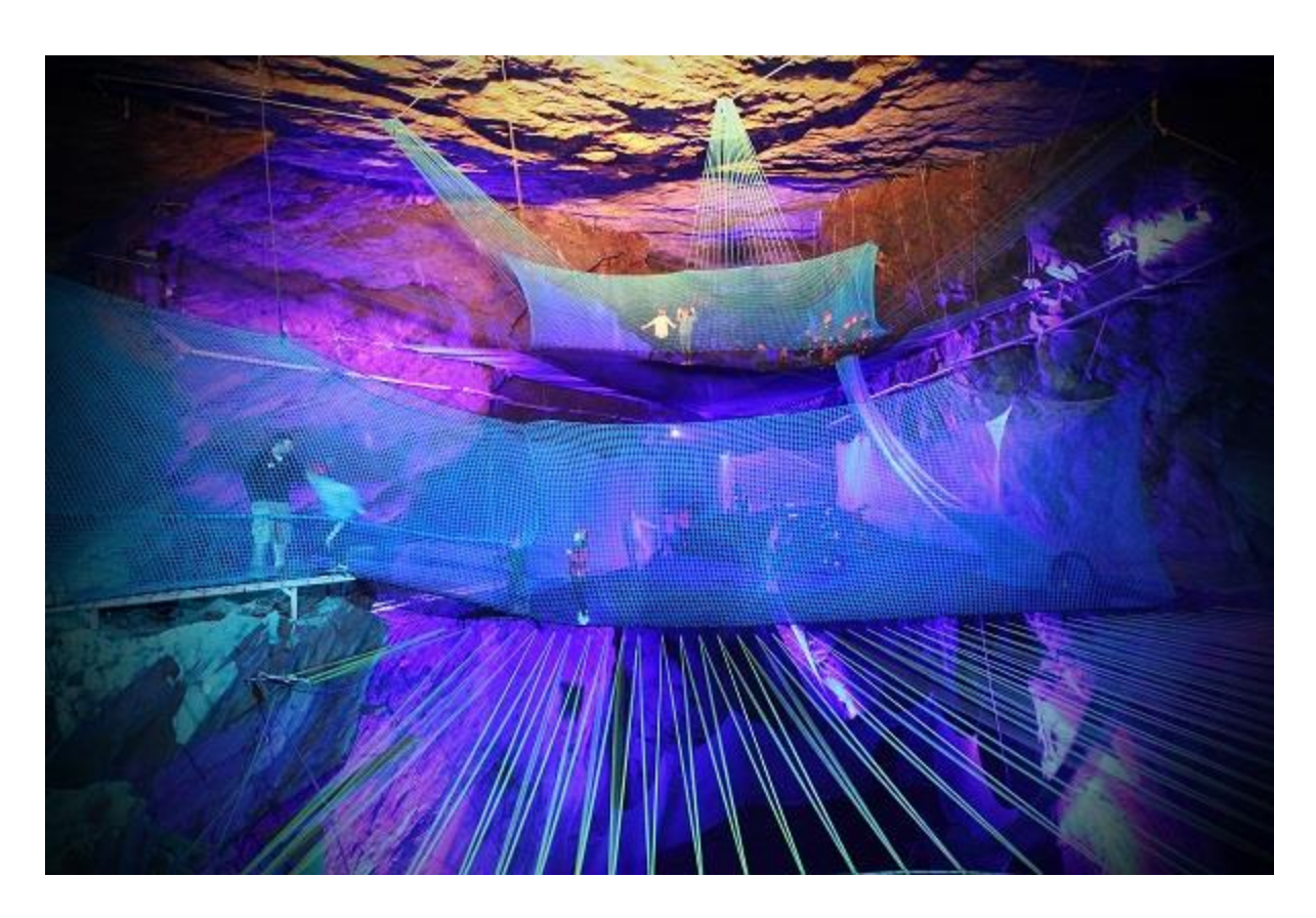
Visitors enjoy the thrill of Bounce Below, an adventure park located in North Wales.

Laura also emphasizes that this isn't only an attraction for those who desire to push their limits, but that this type of exhilarating stimulation is for "everyone! It's an experience that kids and adults can enjoy together; this is suited to all people, no matter what their interests." Although, we do think that people who experience claustrophobia, epilepsy, vertigo or have a heart condition might want to steer clear of this below-the-ground fun palace.