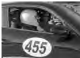
Autocross Corner - Page 13