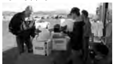
How about a new helmet?