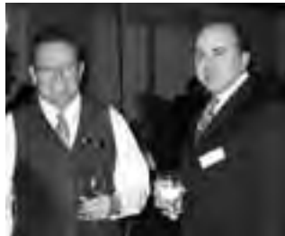
OCR Christmas Party - Page 8