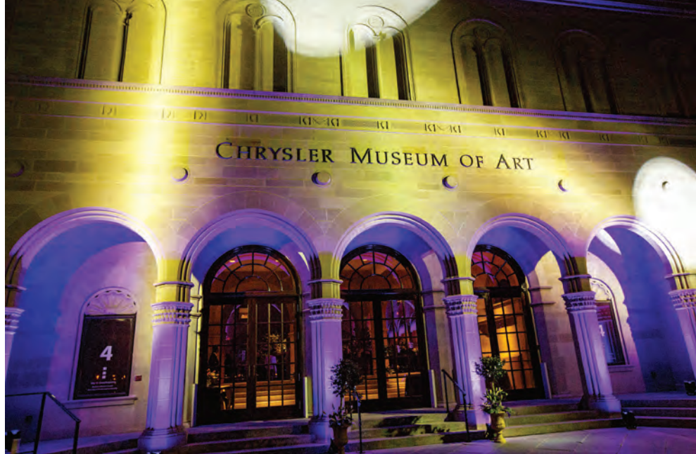
Chrysler Museum of Art

Virginia is running neck-and-neck with D.C. as a top 2015 foodie destination. Its well-regarded wineries are now complemented by booming craft beer breweries and world-class restaurants serving excellent local seafood and produce.