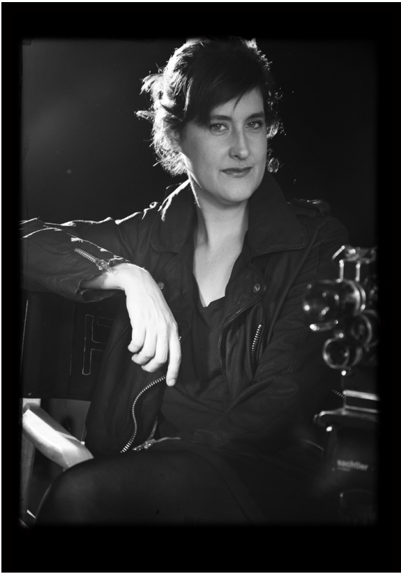
loves jennifer venditti / director DOMA Light blue plaid micromodal top, 88.00.