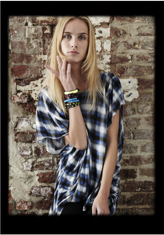
loves alexandra c. / actress TORN BY RONNY KOBO Light blue plaid micromodal top, 88.00.