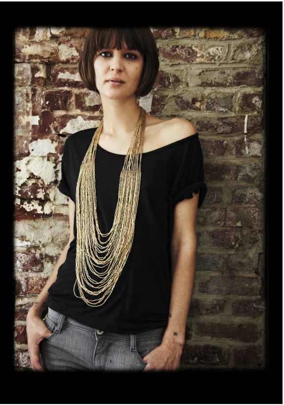
loves shelly z. / actress AQUA yours when you spend 300.00 or more in Y.E.S on August 13. See back cover for more details.