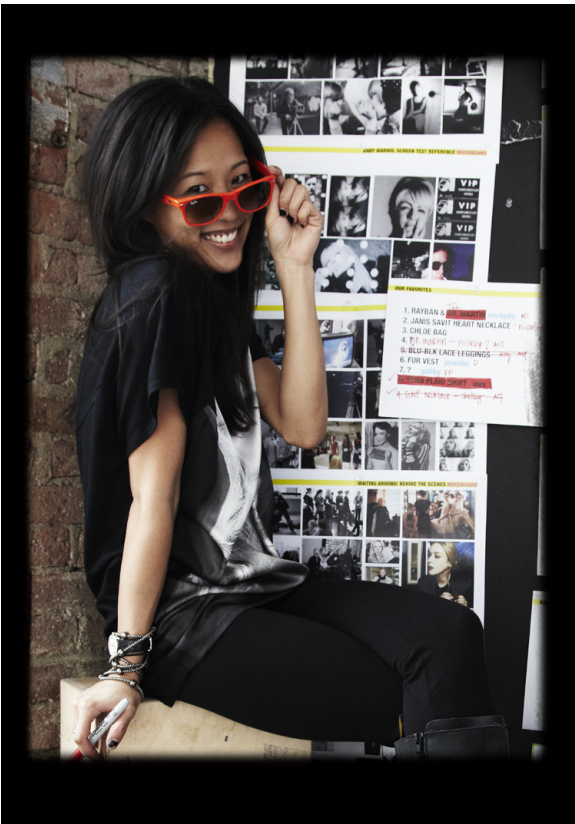
loves michelle suh / art director RAYBAN Light blue plaid micromodal top, 88.00.