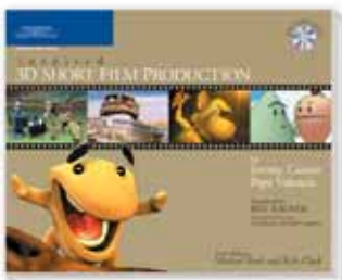
Inspired 3D Short Film Production ISBN: 1-59200-117-3 ■ $59.99