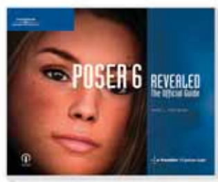
Poser 6 Revealed The Official Guide ISBN: 1-59200-523-3 ■ $24.99

Visit us at Booth 1029 at SIGGRAPH 2005 and check out our latest animation and graphics releases.