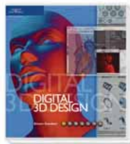
Digital 3D Design ISBN: 1-59200-391-5 ■ $24.99