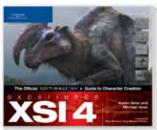
Experience XSI 4 The Official SOFTIMAGE | XSI 4 Guide to Character Creation ISBN: 1-59200-210-2 ■ $49.99