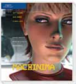
Machinima ISBN: 1-59200-650-7 ■ $29.99