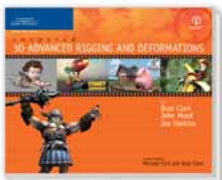
Inspired 3D Advanced Rigging and Deformations ISBN: 1-59200-116-5 ■ $49.99