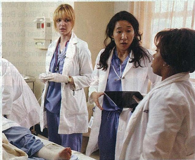
On "Grey's Anatomy," Katherine (with Sandra Oh and Chandra Wilson) plays model-turned-surgeon Isabel "Izzie" Stevens.