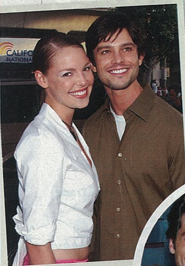
Above: Katherine and ex-boyfriend, "Roswell" castmate Jason Behr. Right: Posing with "Grey's Anatomy" costar Patrick Dempsey.