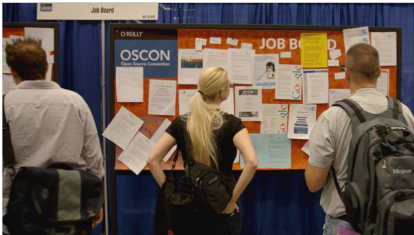
Career opportunities posted on a jobs board.

There's more to international development than managing aid projects. In fact, there are plenty of opportunities for job seekers with all kinds of backgrounds, whether you're a communications guru, an international trade expert or a technology maven.