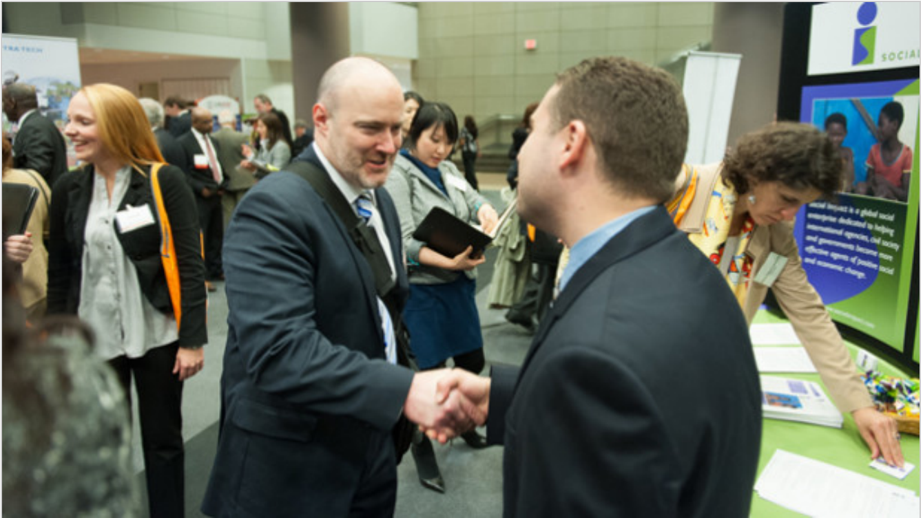
You can find international development career opportunities in unexpected places.

If you're looking to work in international development, you don't have to move to a global development hub such as Washington, New York or even Nairobi, Kenya.