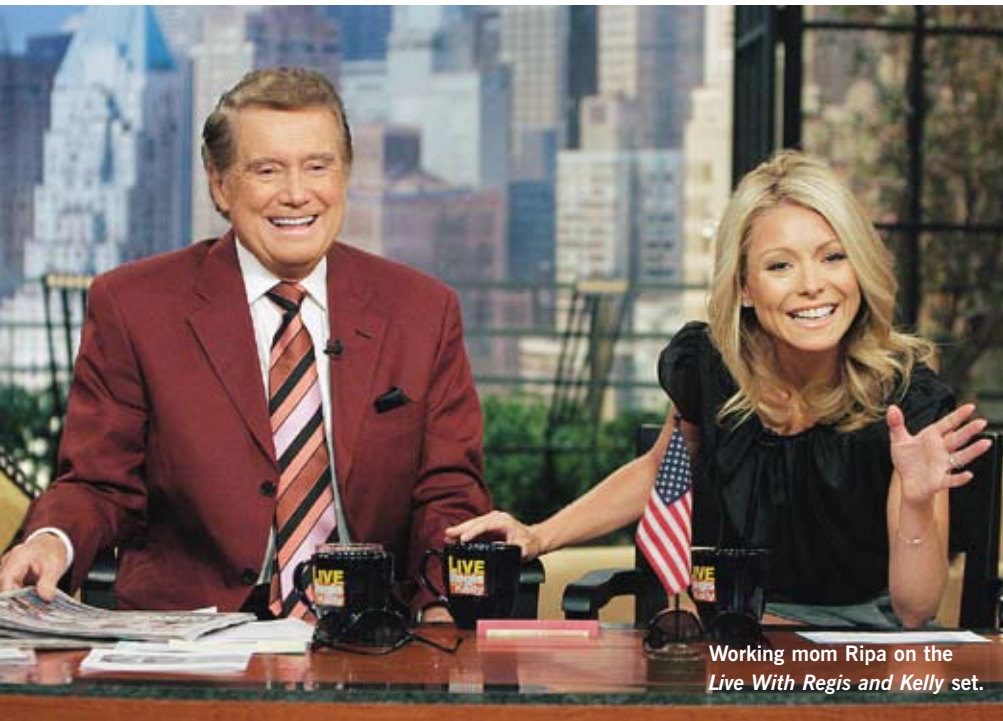
Working mom Ripa on the Live With Regis and Kelly set.

called me up," her mother recounts, laughing at the memory, "and said, 'Mom, all my friends are cutting class. May I, too?'"