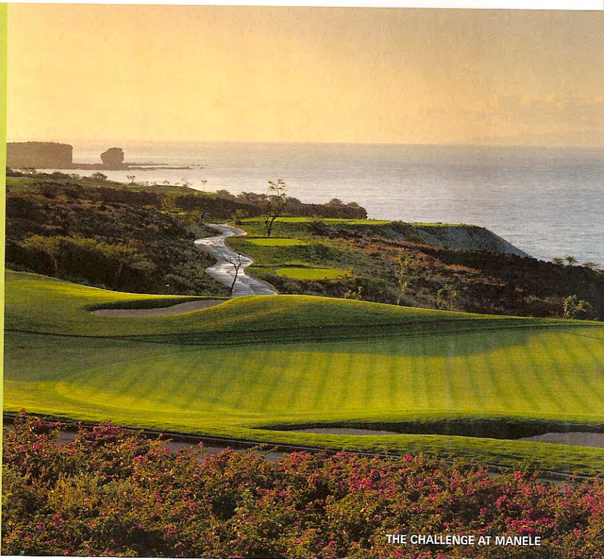
THE CHALLENGE AT MANELE

The nine-mile, dirt Munro Trail dead-ends at the island's highest point—the 3,370-foot Mount Lanaihale.