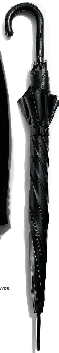
BURBERRY UMBRELLA $275; burberry.com