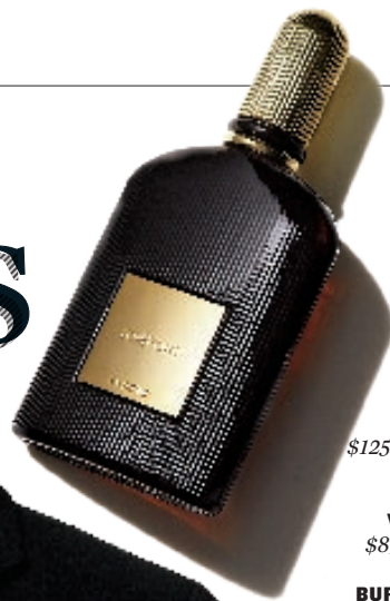
TOM FORD EXTREME $125; Saks Fifth Avenue

If you're a man who sticks to gray suits and unadorned oxfords, this ensemble is how you want to dress for a big night out. The sophistication is in the details: black patent-leather shoes buffed to a high shine, black shirt buttons, and a bow tie you knot yourself. But timeless doesn't mean out of touch: Ditch the cummerbund and leave the wing-tip collar to the maître d'.