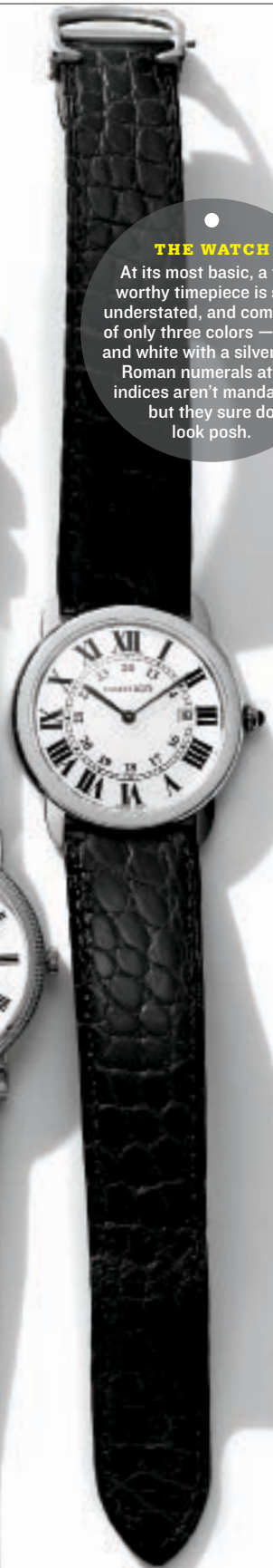
CARTIER RONDE SOLO $2,375; cartier.com