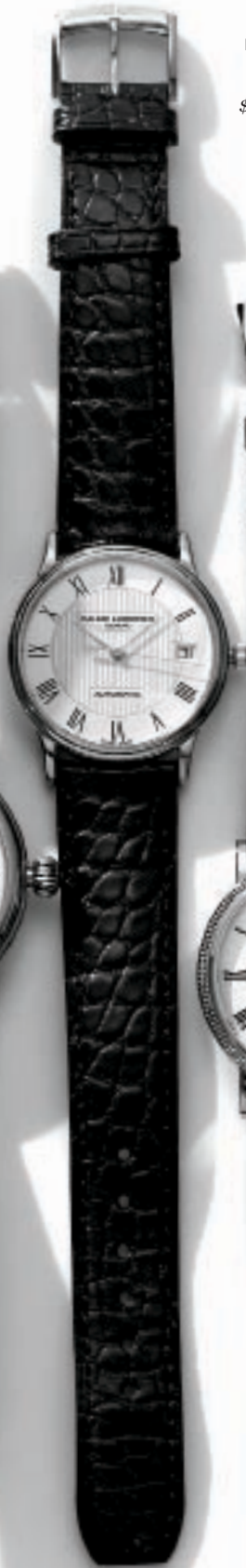
BAUME & MERCIER CLASSIMA EXECUTIVES WHITE GOLD $3,590; baume-et-mercier.com