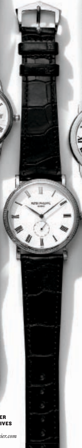
PATEK PHILIPPE CALATRAVA WHITE GOLD $18,900; patek.com