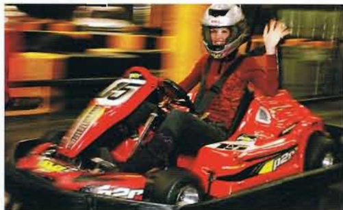
Kathryn Morris attends the Celebrity Racing Charity Event at the Pole Position Raceway in Corona, California.

And that same attitude has her taking up motocross and even being a partner in Pole Position Raceway, a go kart center with locations in