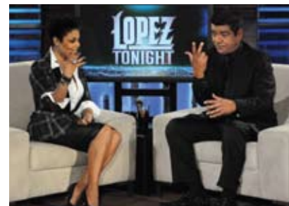
Janet Jackson visits with George on the set of Lopez Tonight .

"A guy came to the show crying because his brother in Mexico was dying—he needed a kidney transplant," Lopez muses. "And we got the guy surgery. Oprah gives away cars, I'm giv-