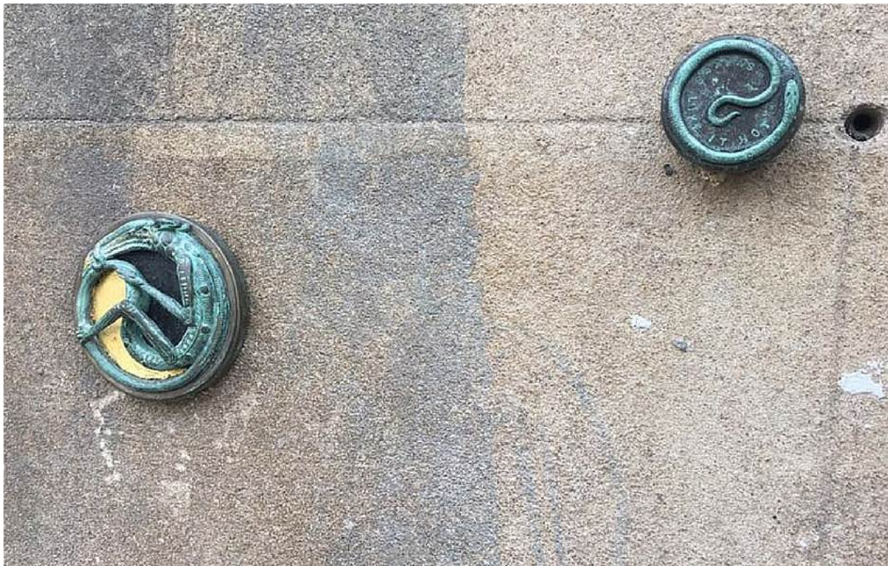
At University of South Florida At University of South Florida