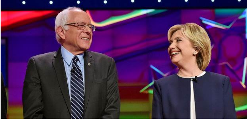
At University of Missouri At University of Missouri