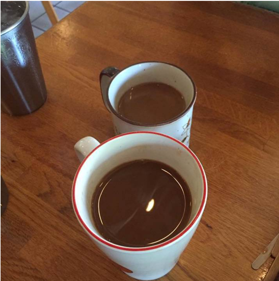
At University of Missouri At University of Missouri