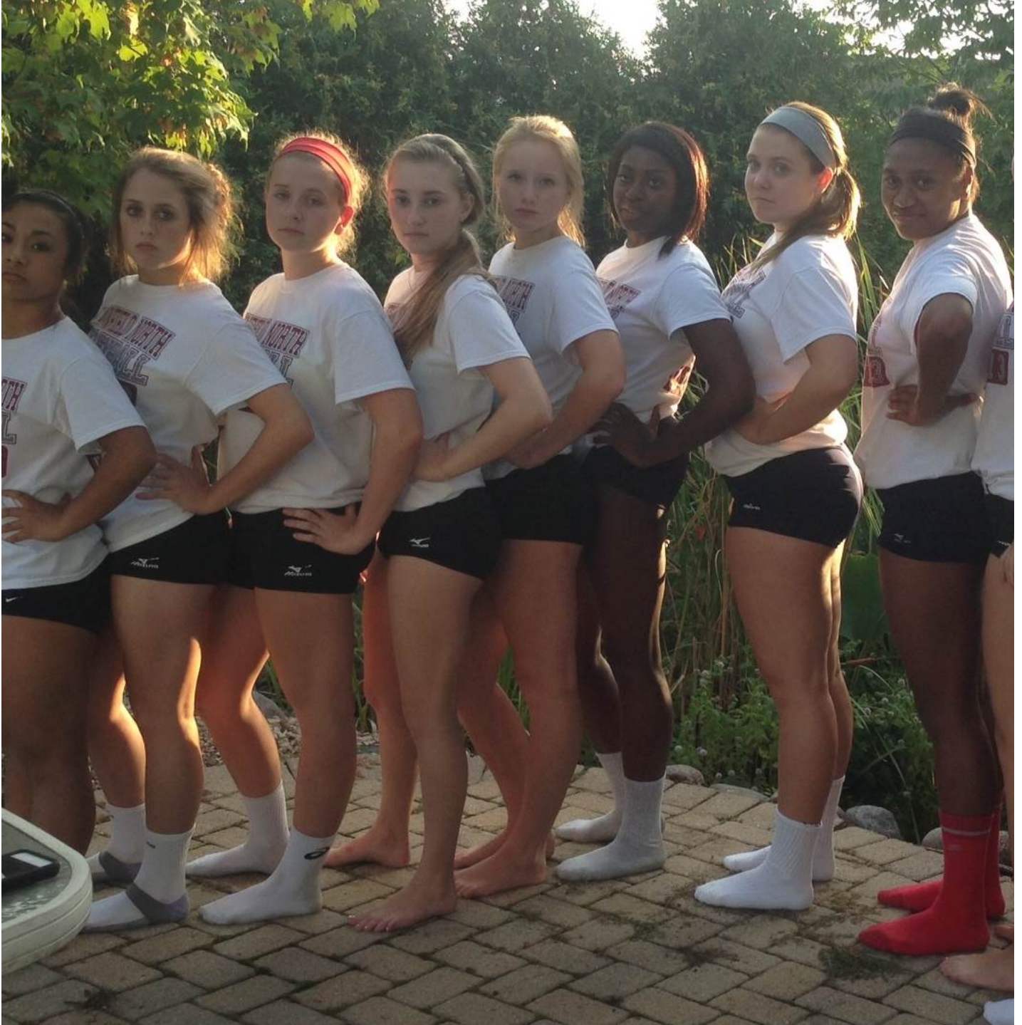
At University of MissouriAt University of Missouri