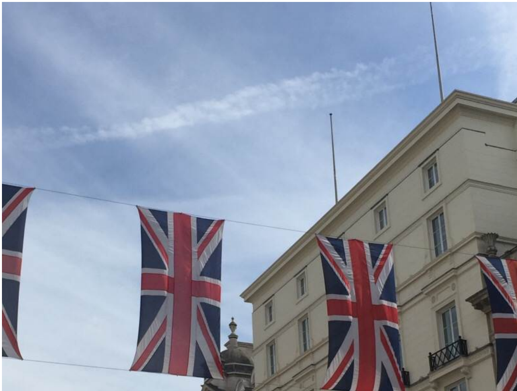
At University of Missouri