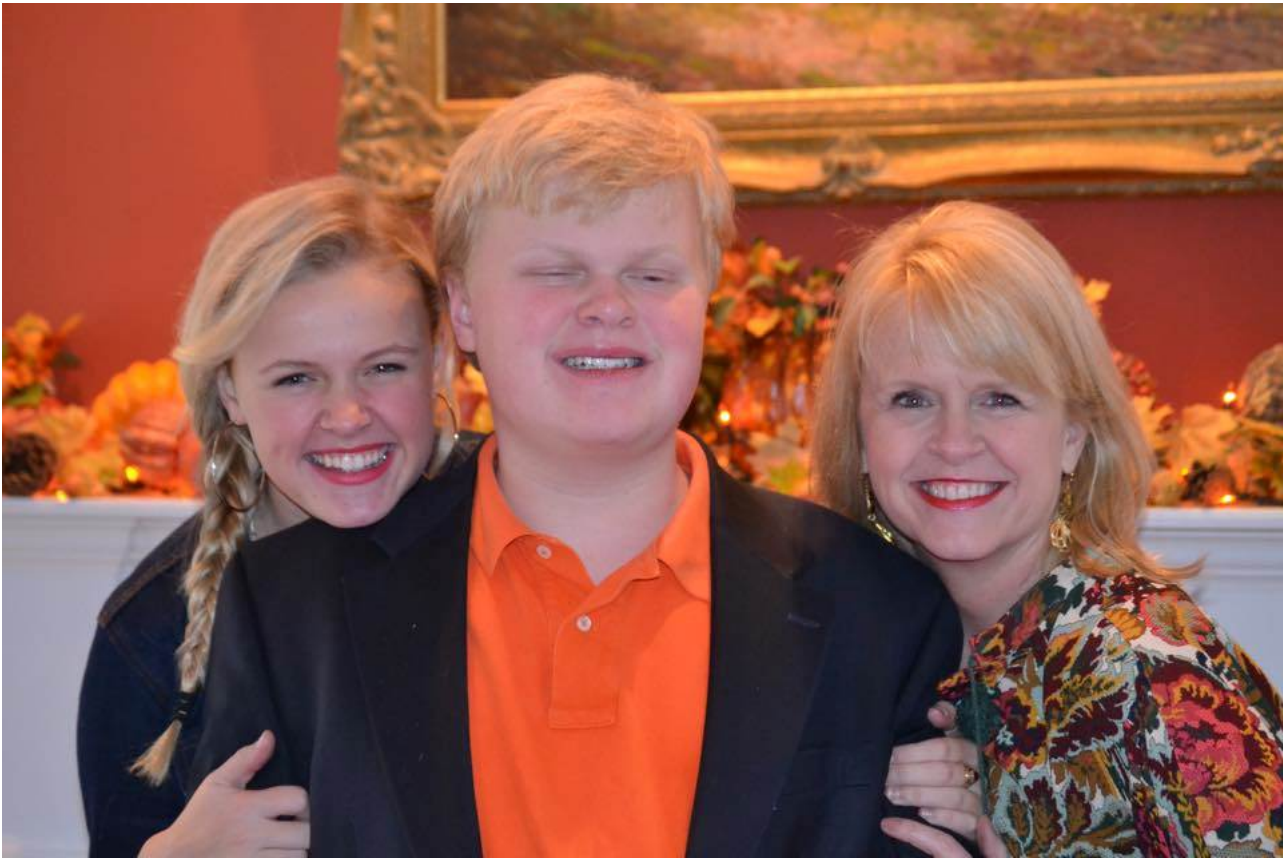
At University of Missouri At University of Missouri