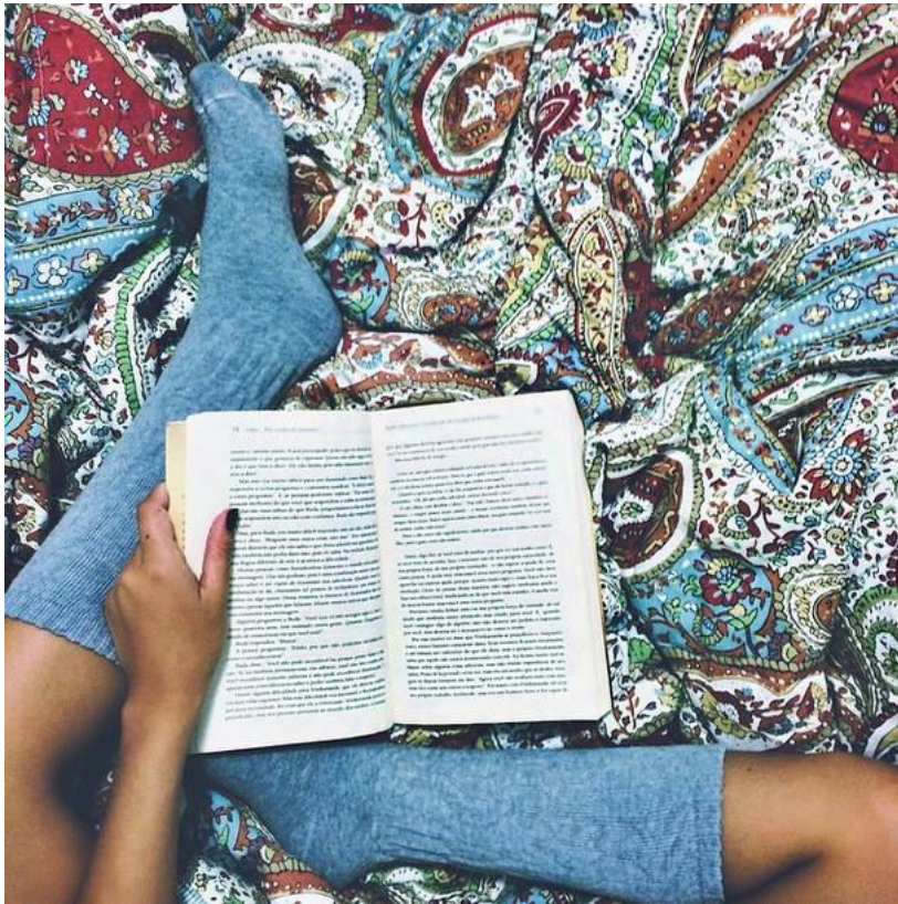
At University of Missouri At University of Missouri