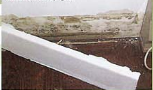
Chaetomium and Aspergillus

It's this mold that prompted former Tonight Show sidekick Ed McMahon to file a $20 million lawsuit against his insurance company for failing to properly clean up after fixing a broken pipe in his California home. In the suit filed this past April, McMahon contends that the mold from the broken pipe spread throughout his home and killed his dog.