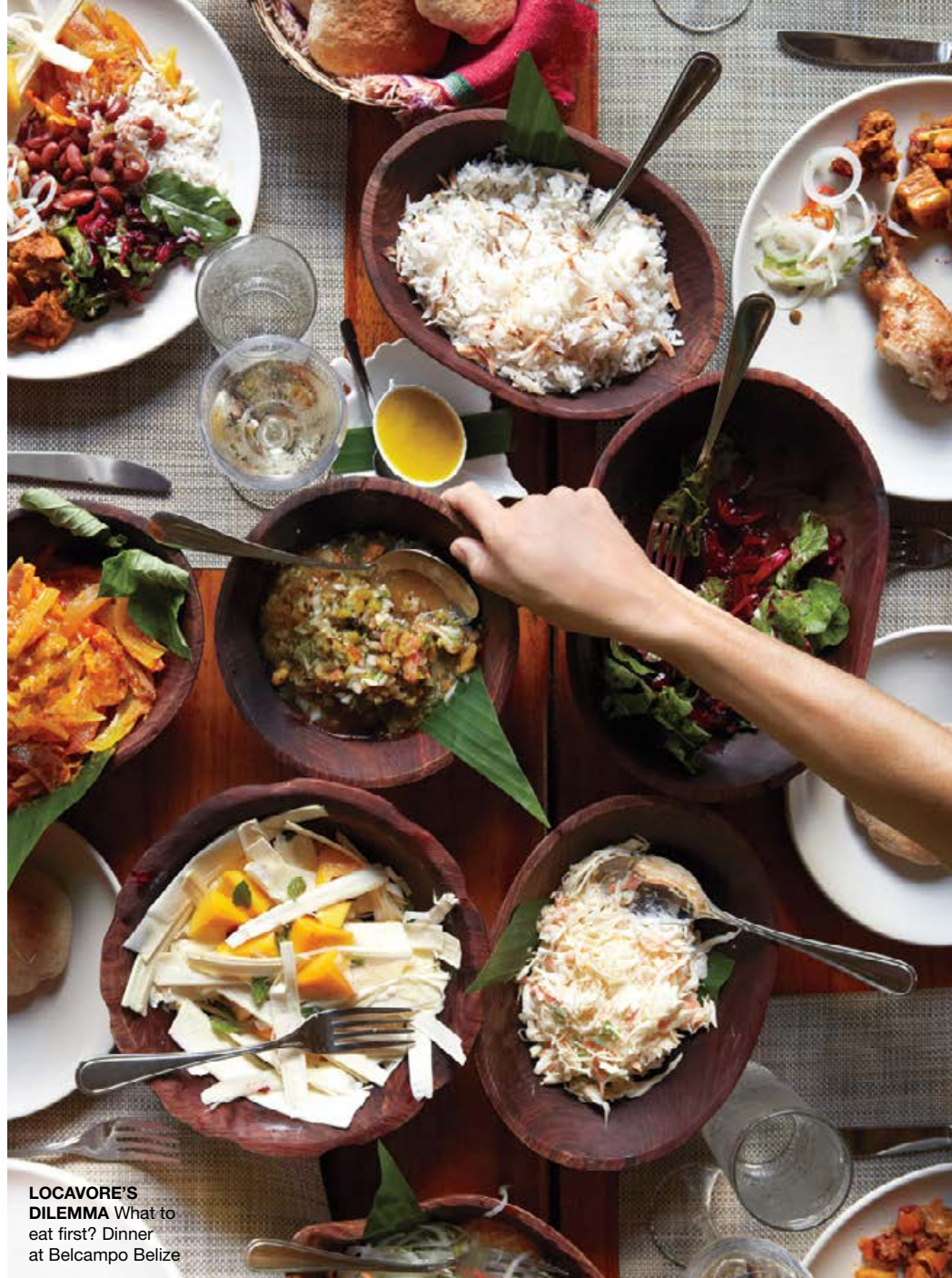
LOCAVORE'S DILEMMA What to eat first? Dinner at Belcampo Belize