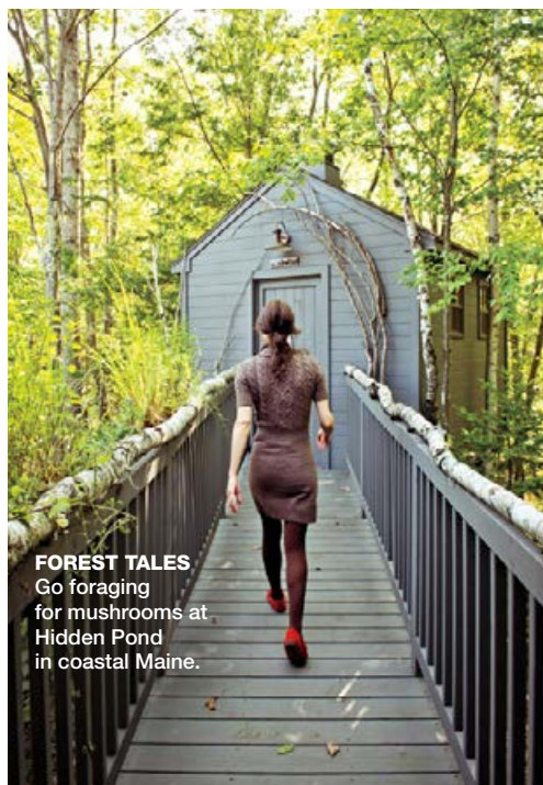
FOREST TALES Go foraging for mushrooms at Hidden Pond in coastal Maine.