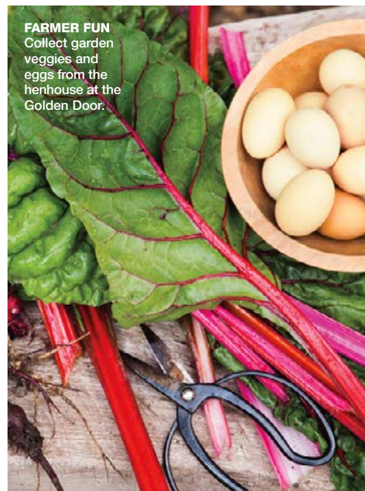
FARMER FUN Collect garden veggies and eggs from the henhouse at the Golden Door.