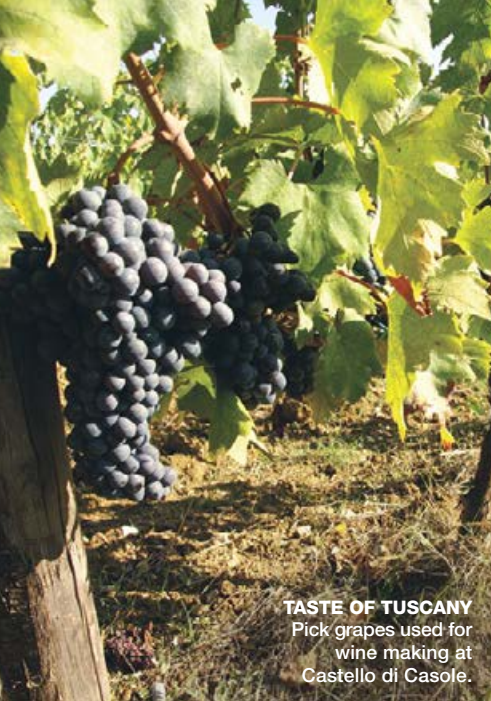
TASTE OF TUSCANY Pick grapes used for wine making at Castello di Casole.