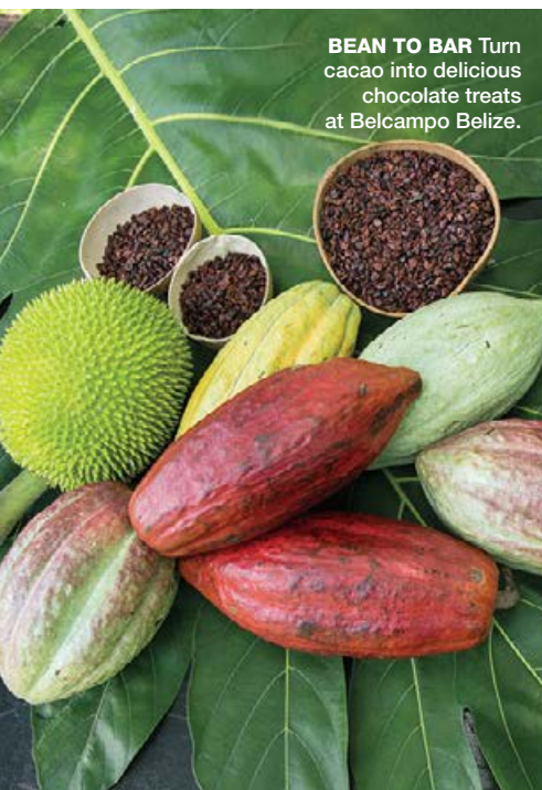
BEAN TO BAR Turn cacao into delicious chocolate treats at Belcampo Belize.