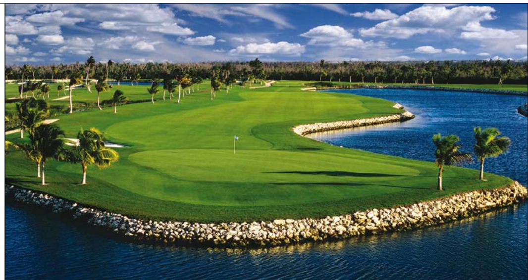
Greg Norman designed golf course, built among lagoons, offers world-class golf to Grand Cayman for the first time.

could. The morning after Ivan hit, all of my 1,000 employees turned up onsite to offer their services without ever having been called."