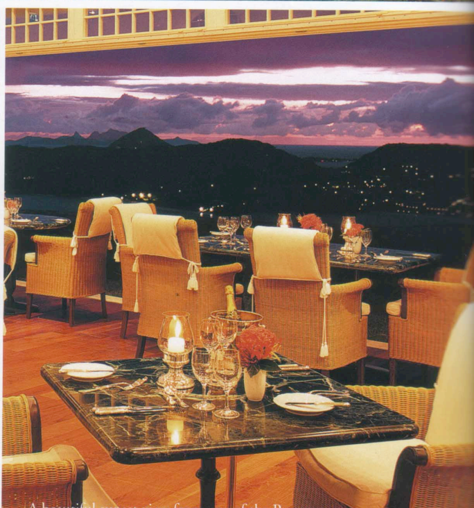
A beautiful sunset view from one of the Restaurants