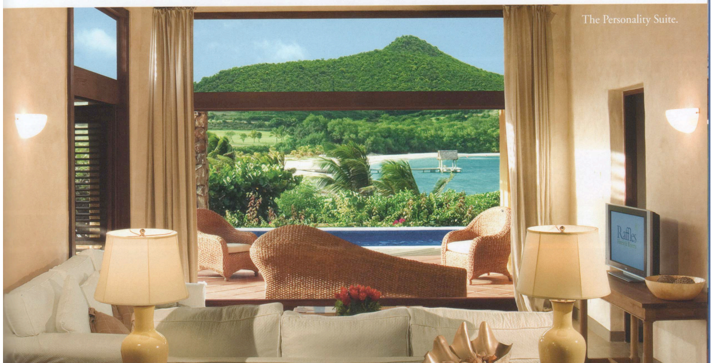
The Personality Suite.

Just a short hop away from Barbados, Raffles Canouan is a little piece of heaven on earth.