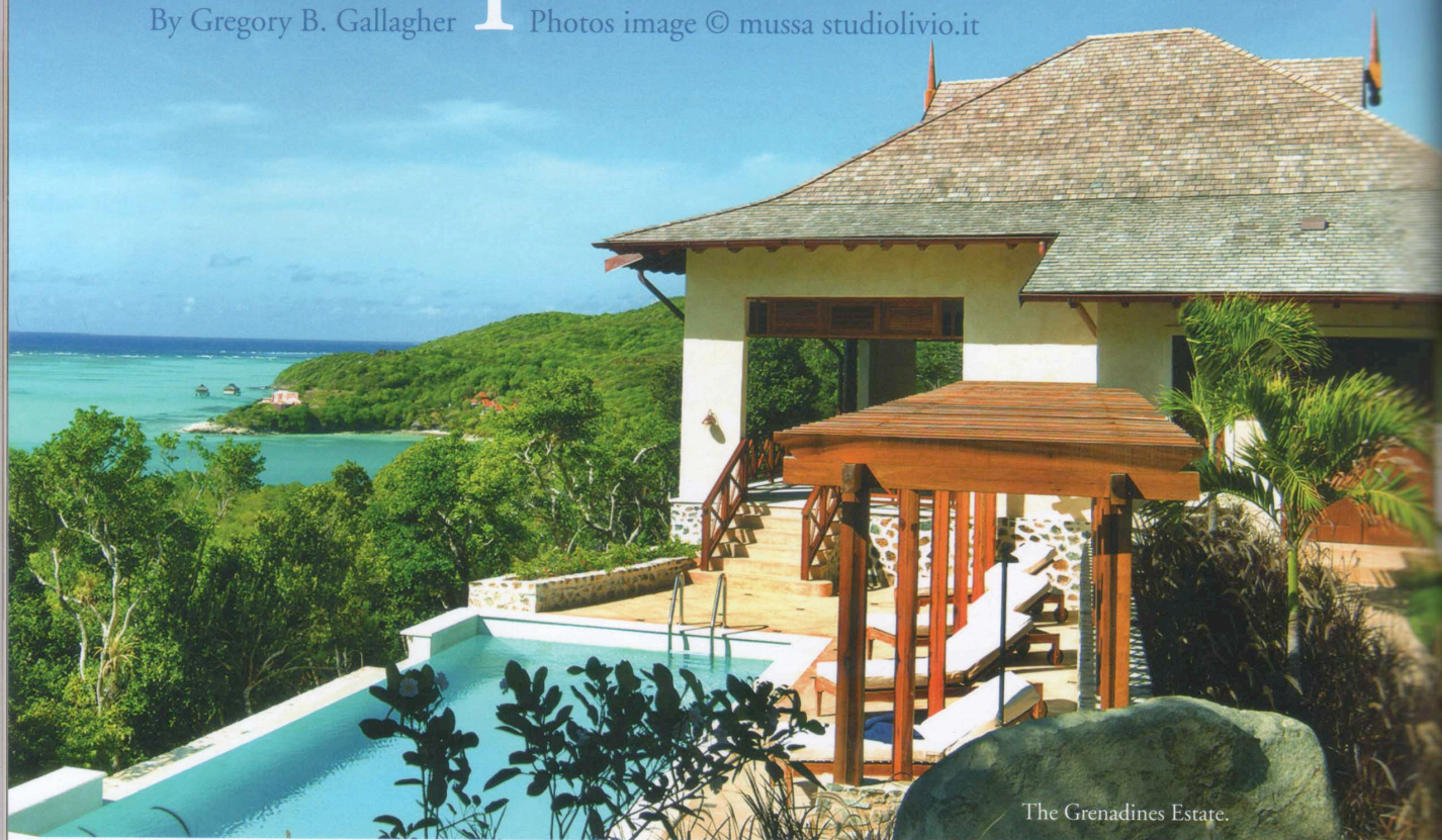
The Grenadines Estate.

By Gregory B. Gallagher