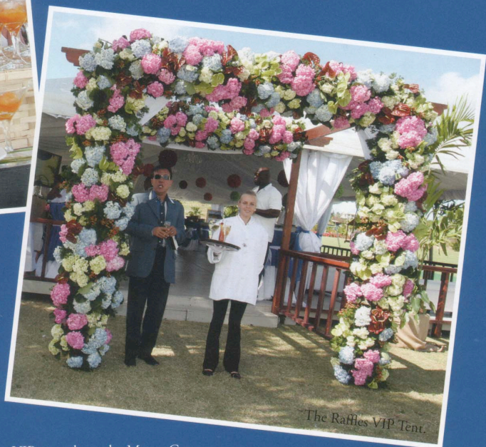
Raffles VIP tent