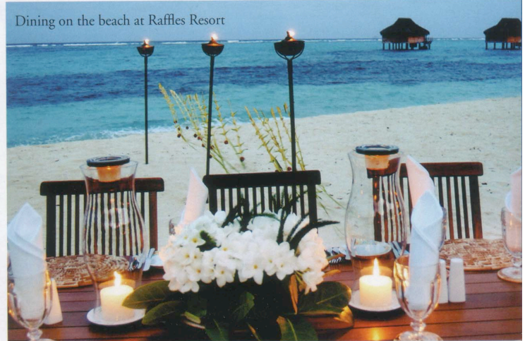
Dining on the beach at Raffles Resort