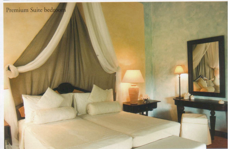
Premium Suite bedroom