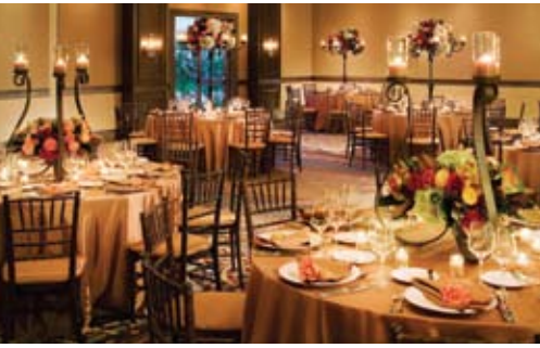
InterContinental Montelucia Resort & Spa in Scottsdale offers a complete wedding package, including on-site hair and makeup, a private bridal party suite, multiple ceremony and reception options and luxurious accomodations for your wedding guests.