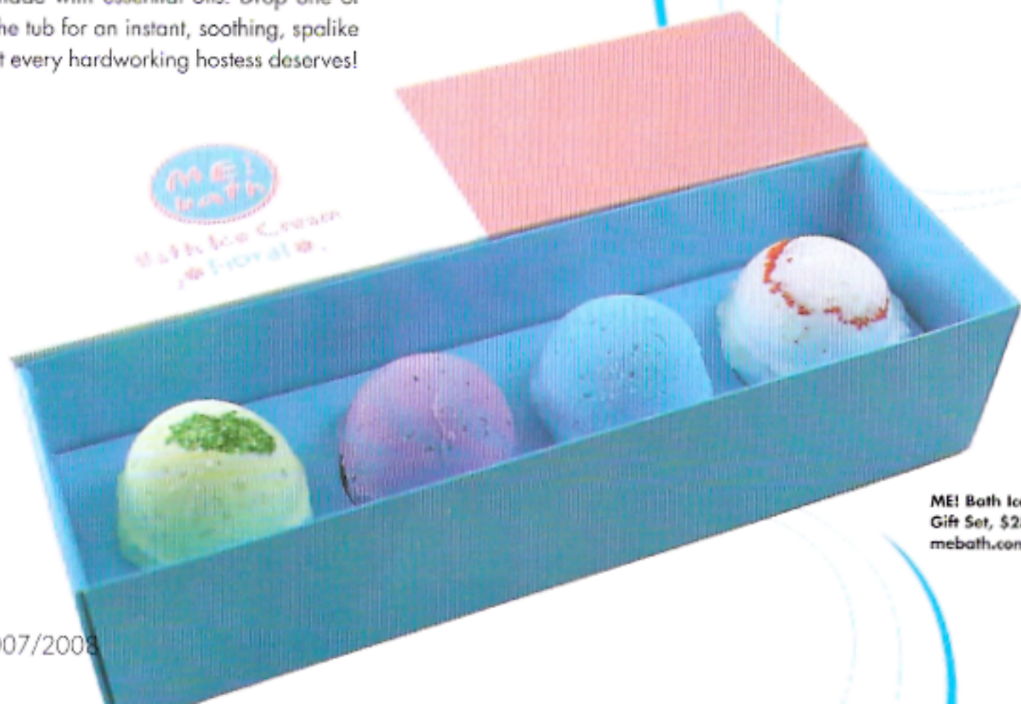
ME! Bath Ice Cream Gift Set, $28, visit mebath.com

Sweet teeth rejoice in calorie-free indulgence. The ME! Bath Ice Cream gift set scoops up four artisan-crafted bath "ice creams," handmade with essential oils. Drop one of these fizz balls into the tub for an instant, soothing, spalike experience. Just what every hardworking hostess deserves!