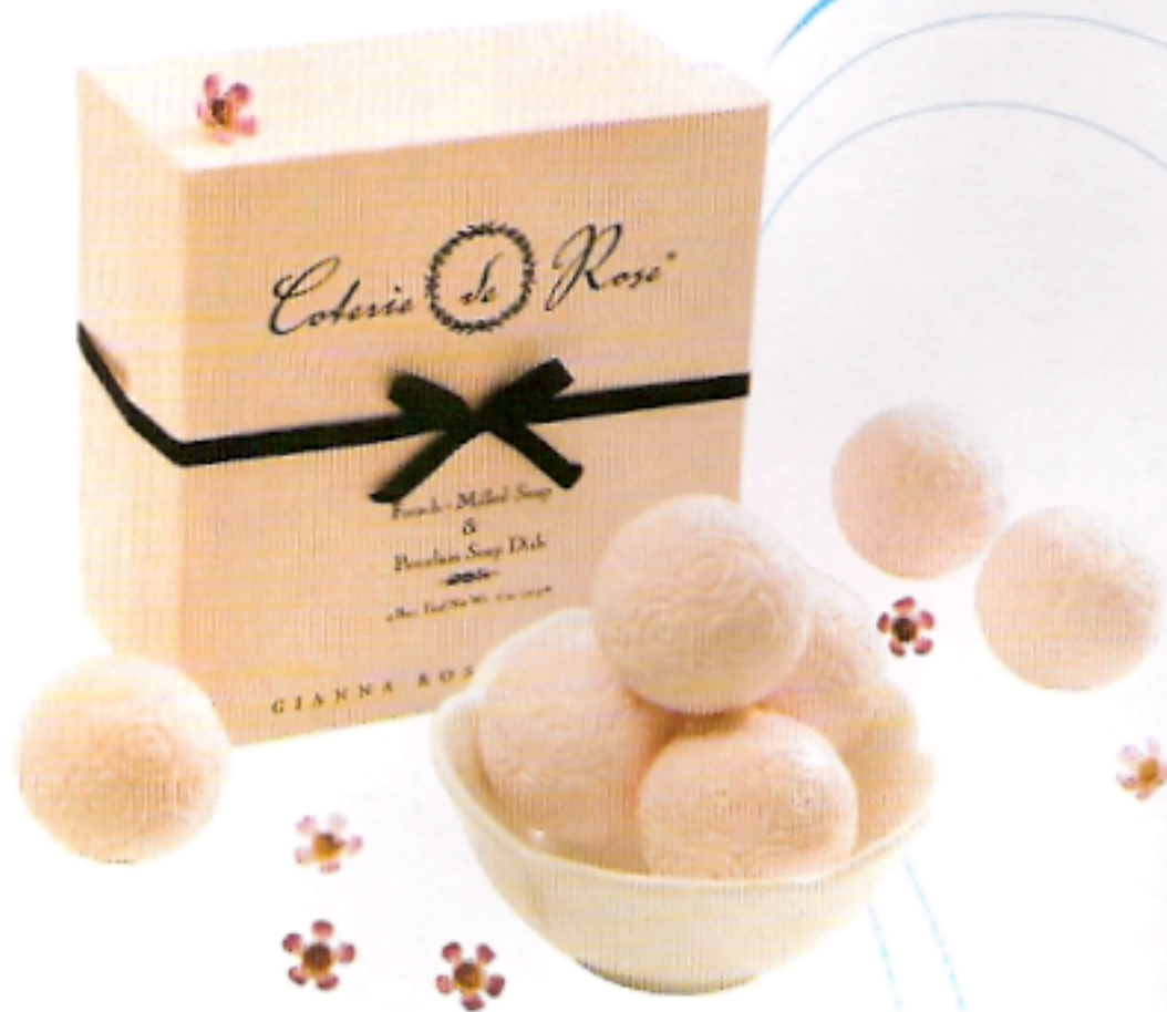
Gianna Rose Atelier's, Coterie de Rose Soaps, $23.50, visit giannarose.com

Whether it's the Rose Bowl or Super Bowl, one good bowl deserves another. Gianna Rose Atelier's Coterie de Rose soaps and the lovely bowl they come in are a perfect addition to any bathroom décor. And the four spheres of triple-milled rose-scented soap come in handy after all those high fives.