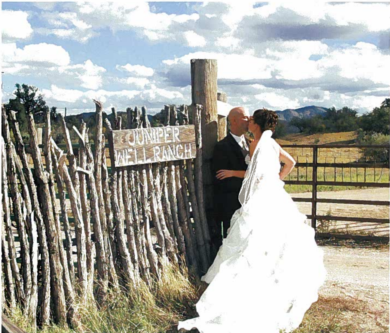
The stunning beauty of Northern Arizona can only enhance the joy of your wedding day.