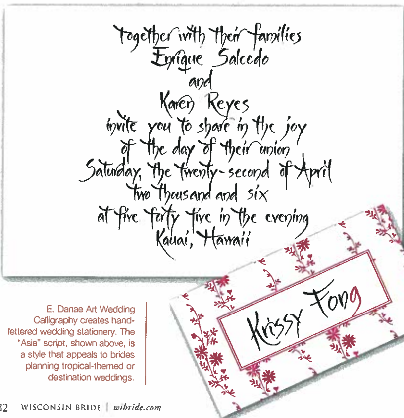
E. Danae Art Wedding Calligraphy creates hand-lettered wedding stationery. The "Asia" script, shown above, is a style that appeals to brides planning tropical-themed or destination weddings.

A Along with planning all the delicious details of your nuptials comes the business and legal side of the process, which makes your wedding day official. You must apply to the county clerk for the county in which one or both of you reside within 30 days of the wedding. Keep in mind, too, that there is a five-day waiting period between the date of application and the issuing of the license. Once the license is issued, the couple must get married and sign the papers within 30 days. When going to the county clerk's office to apply for a marriage license, each applicant must provide a current driver's license with up-to-date address, proof of Social Security number, and a certified copy of his or her birth certificate. The fee for obtaining a license varies from county to county, but on average costs $80 and is due the date of application. Both applicants must be present when filing and should be prepared to state the location and date of their wedding, as well as the correct spelling of the officiant's name. To find out more, contact the county clerk for the county in which you reside.