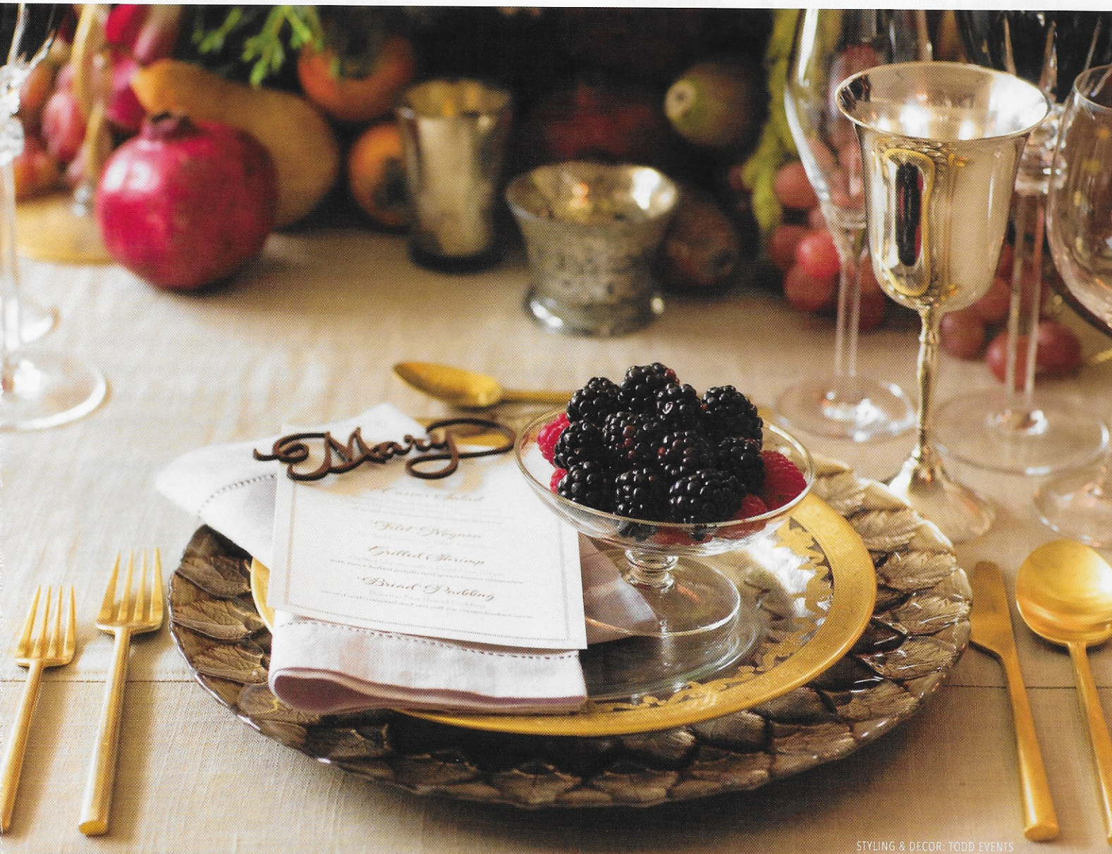
STYLING & DECOR: TODD EVENTS