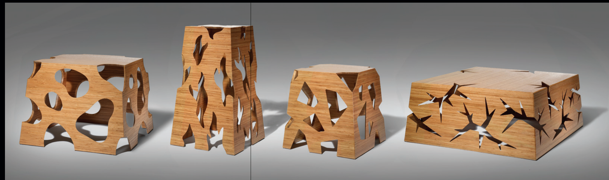
CNC TABLE GROUP (SPRING, SUMMER, AUTUMN, WINTER)