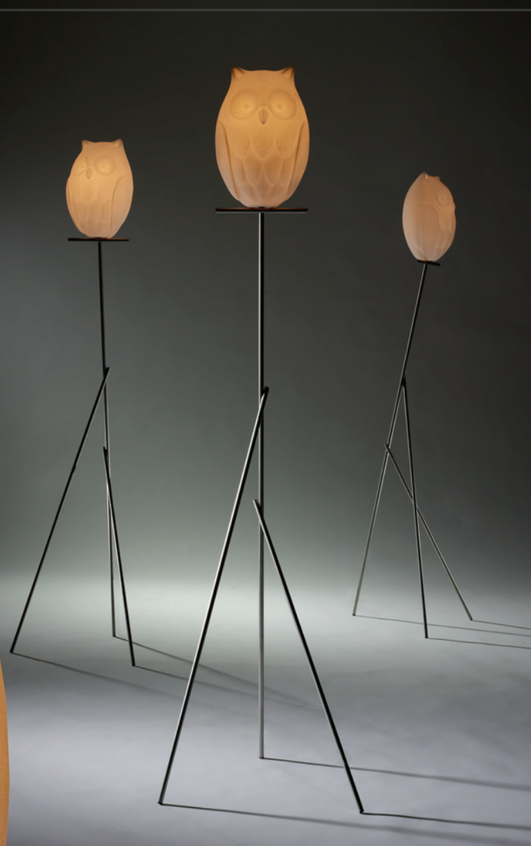
NIGHT OWL FLOOR LAMP