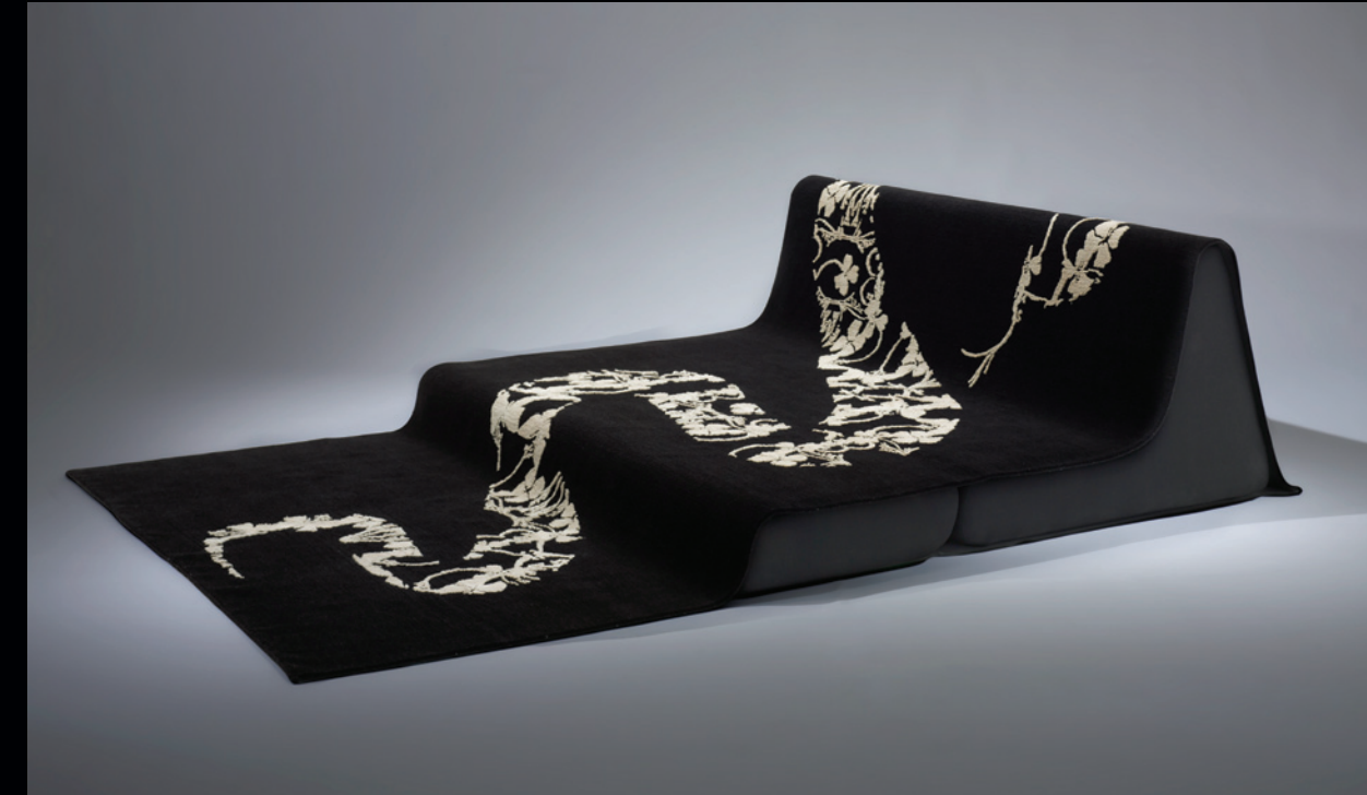
DUNE SEATING/SLEEPER RUG UNIT