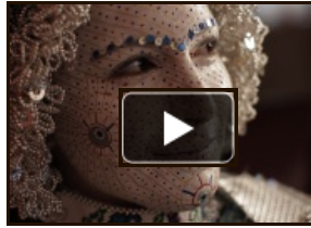
April 19, 2012 This Earth Day, See The Whole World In One Film