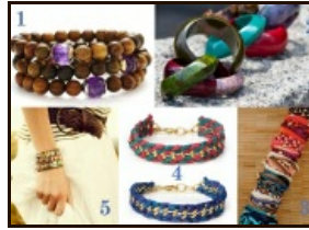
April 18, 2012 Wrist Candy: Do-Good Bracelets & Bangles

DESIGN FOUNDATION INDUSTRIES FIGHTING AIDS DIFFA .ORG