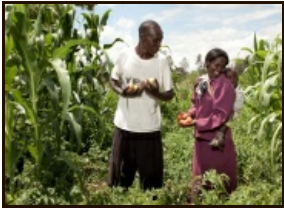
April 20, 2012 Join The Tribe: The Adventure Project