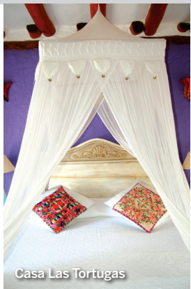
Casa Las Tortugas

» Seaside cocktail service and teak chaises, suspended day beds, and dories filled with colorful pillows create a boho chic beach scene. » The Yucatan décor of the 21 rooms and suites features hand-carved armoires, hand-embroidered pillows and hand-painted bathroom sinks. Choose one with a balcony overlooking the Caribbean. » Located off the free-form pool in the tropical courtyard, the small Agua Spa