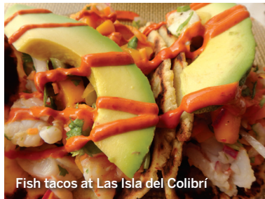
Fish tacos at Las Isla del Colibrí

» With a Mayan jungle scene painted on the outside of the wooden house, you can’t miss this lively restaurant, which is located on the