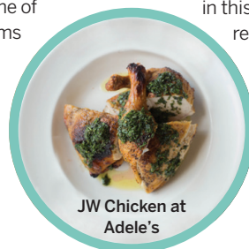
JW Chicken at Adele's

» From pizzettes to burgers, many dishes are cooked in wood-fired ovens, creating a mouth-watering aroma.