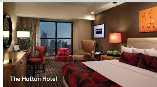
The Hutton Hotel

» White leather headboards, whimsical but comfy chairs and a burgundy and taupe color scheme make the rooms and suites feel modern but not trendy. Spacious desks have mobile device charging and A/V outlet