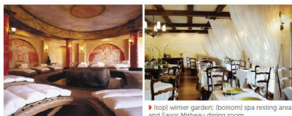
▶ (top) winter garden; (bottom) spa resting area and Savor Mirbeau dining room