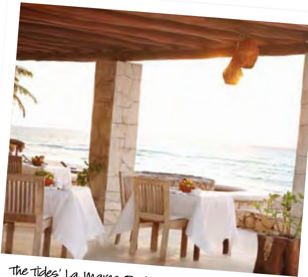
The Tides' La Marea Restaurant affords diners spectacular views of the Caribbean Sea.