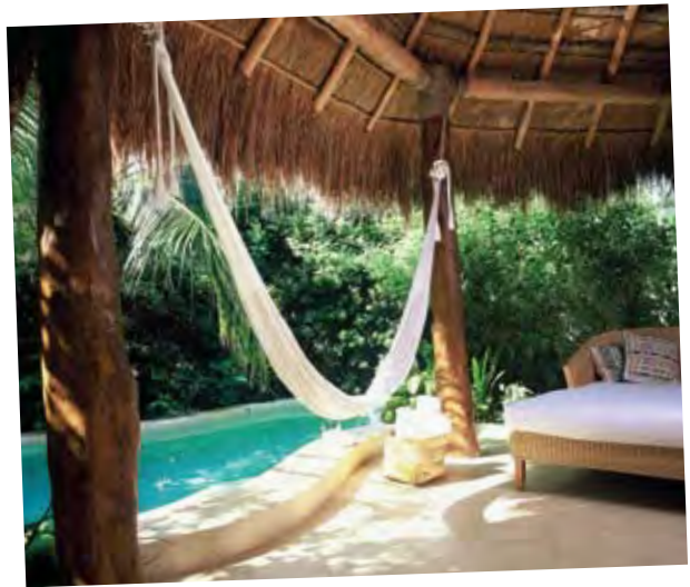
Hang loose at one of the Tides Riviera Maya's Luxury Villas with private plunge pools.