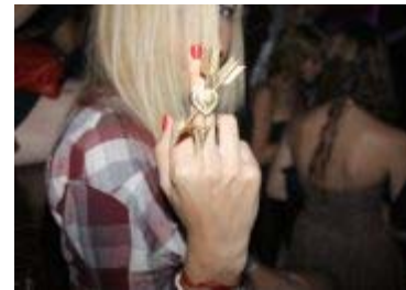
MSTRKRFT at LIV