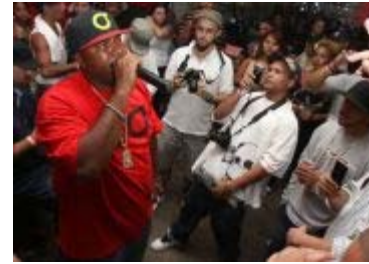
N.O.R.E. at White Room