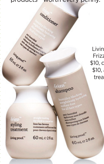
Living Proof No Frizz shampoo, $10, conditioner, $10, and styling treatment, $15.

Wash your hair two nights before the wedding (the night before, if it's super-oily), says New York stylist Tyler Laswell. Towel it dry before applying conditioner (dry hair will absorb it better), then do a final rinse. And choose a styling product containing little to no water—you don't want to add excess moisture. We're crazy about the Living Proof No Frizz products—worth every penny.