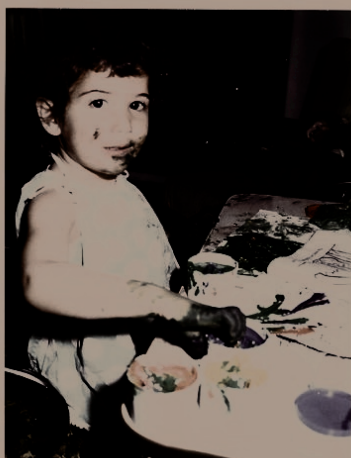
The author finger-painting in May 1973, and the last letter to the author from her mother, written in the winter of 1977.