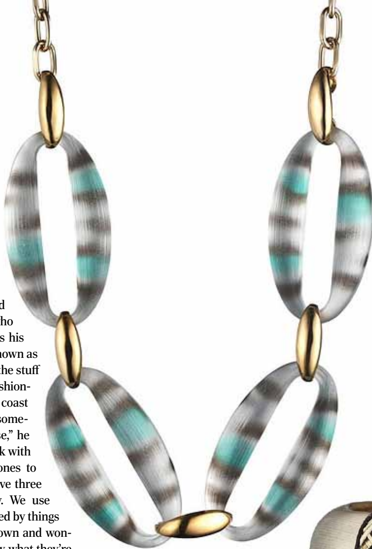
18-inch Zanzibar gold leopard-link necklace; $350

Next up—drum roll, please—is a foray into fine jewelry, by spring 2012. “It’s definitely going to be a marriage of modernism with the craftsmanship of antiques,” says the designer, noting price points will range between $250 and $12,000. “It will combine bridge and fine, sterling with gold, precious with semiprecious. Other than that I can’t give you too much.” ■