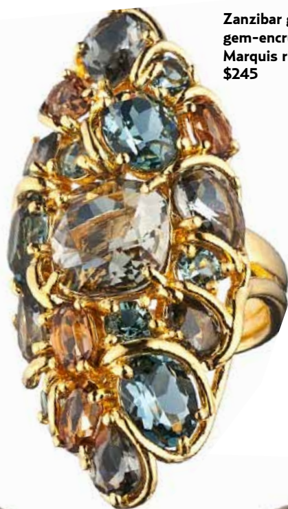
Zanzibar gold gem-encrusted Marquis ring; $245

"We work with everyone," Bittar says matter-of-