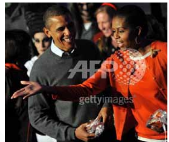
On Halloween 2010, fashionable First Lady Michelle Obama welcomed trick-or-treaters to the White House while wearing a Bittar bumble bee.

"I get excited when I see a woman comfortably standing out of the pack. I'm not attracted when it's from a pretentious standpoint, but the need to express herself."