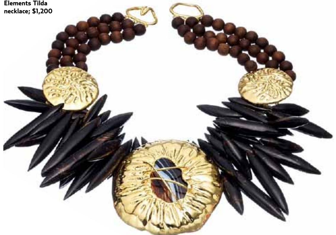
Elements Tilda necklace; $1,200