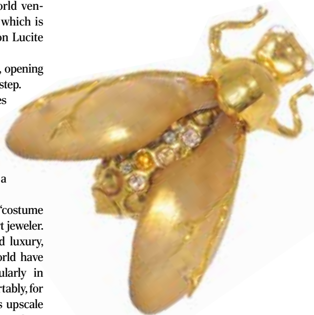
The Midnight Garden Gold Ombre Bee Pin, as seen on Mrs. O