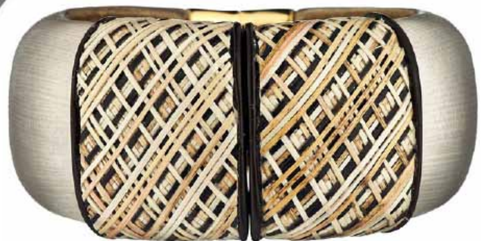
Zanzibar gold large wicker-hinge bracelet; $395