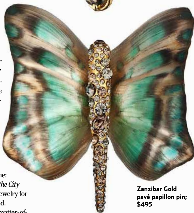
Zanzibar Gold pavé papillon pin; $495