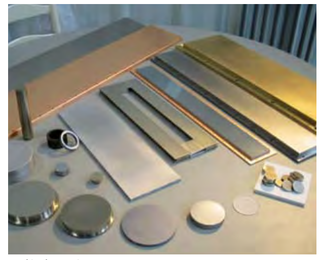
Machined sputtering targets.