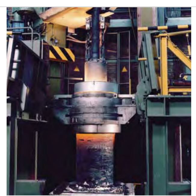
Electro-slag remelt (ESR), showing an ingot in the process of remelting.