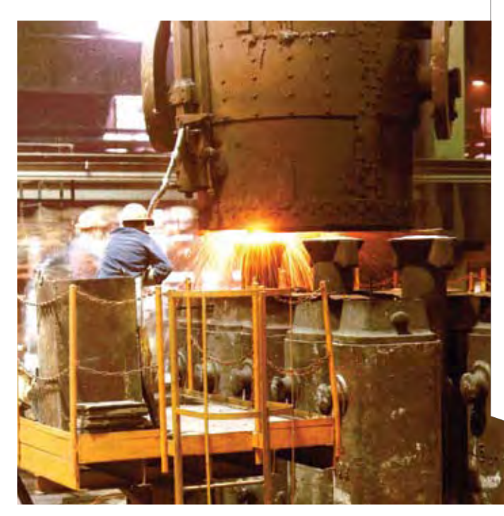
Bottom pouring of tool steel into ingots.

You may never need a designer alloy, but sometimes perhaps a variation on a standard alloy will improve your