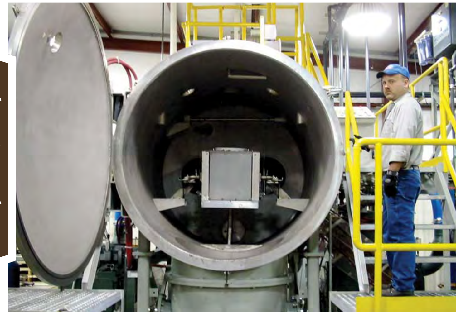
Inside view of vacuum induction melting chamber showing melt coil and crucible.

One type of composite is made from titanium and tiny particles of titanium carbide, a ceramic similar in properties to tungsten carbide. The resulting composite material has improved wear resistance over titanium metal. Different formulations of this titanium/titanium carbide material are being used in and developed for an extremely diverse range