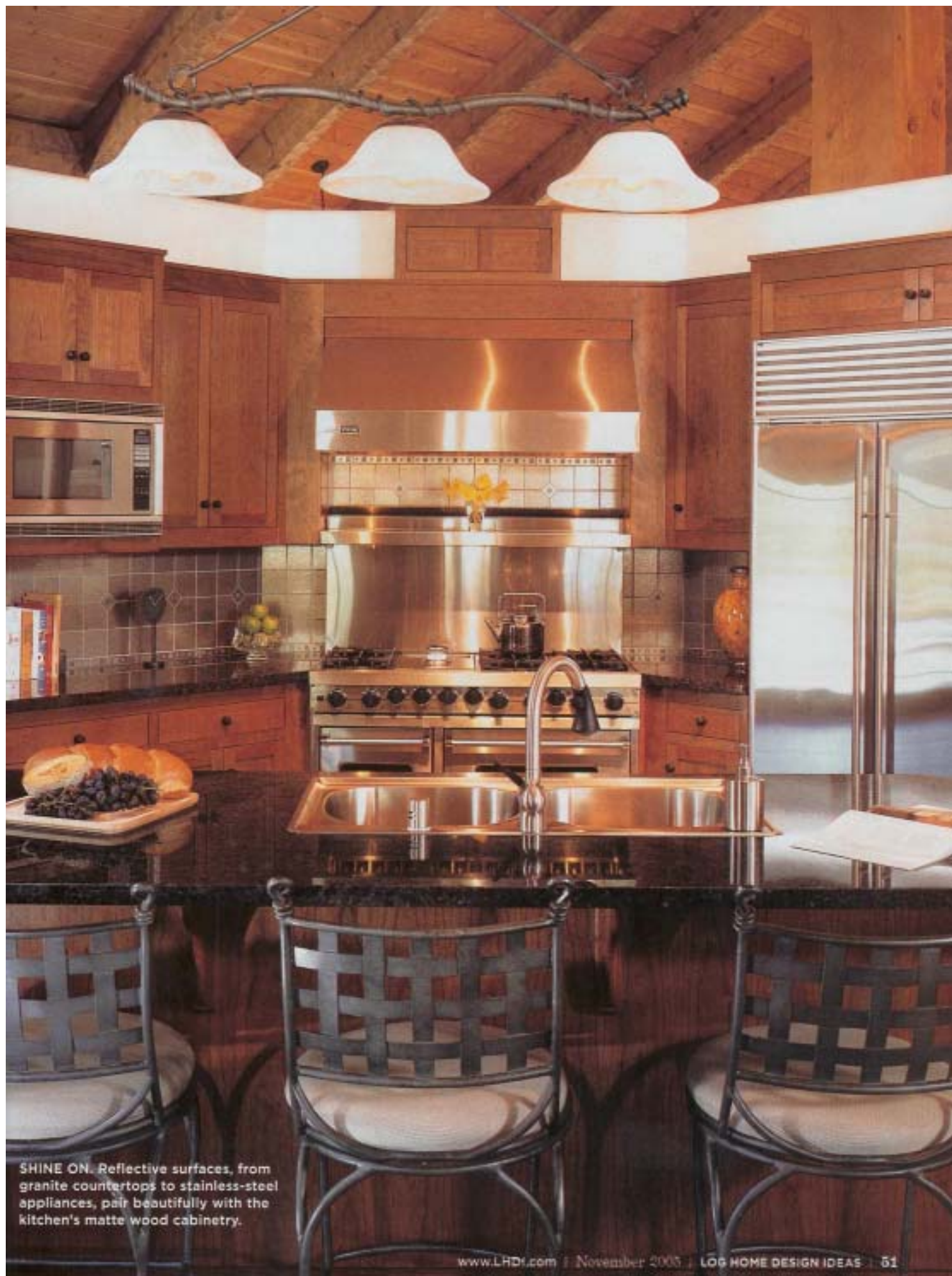
SHINE ON. Reflective surfaces, from granite countertops to stainless-steel appliances, pair beautifully with the kitchen's matte wood cabinetry.