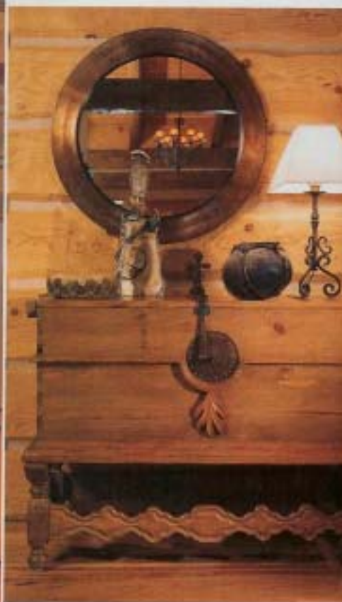
LEFT: A Waterford wood stove is nestled inside a hearth of natural and faux lodge rock. The handcrafted sofa complements the coffee table made from an antique door. ABOVE RIGHT: Mission and Spanish antiques adorn the home.