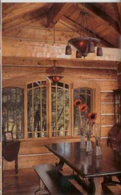
LEFT: At meal time, the family enjoys their surroundings from arched Craftsman-style windows. "You just can't reproduce the feeling that comes from living with natural elements," says Anne Marie. ABOVE: The handsome monk's table is a family antique.

drawings, then disassembled the structure and shipped it to the site.